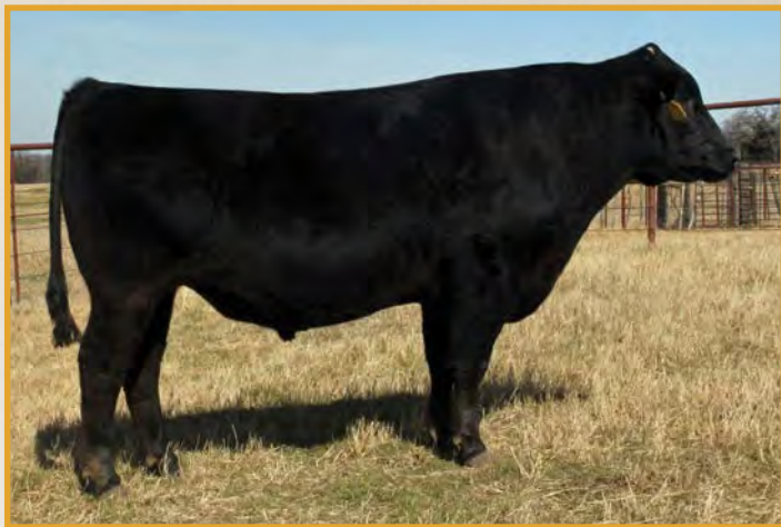
M6 SHIGESHIGETANI 5173C • SELLS AS LOT 66.

BW 59, Adj. 205 day weight of 503 lbs. Ultrasound IMF of 5.42 on 1/12/2017 and REA of 1.31 on 1/12/2017. He tested the perfect 10 for tenderness with a VV score for SCD. Holy cow!!!! M6 Shingeshigetani 5173C is a powerful and attractive bull with the largest REA in his contemporary group. He also has a stacked pedigree for marbling muscle, and performance. His sire, Bar R Shingeshigetani 30T is a well documented proven herd sire for REA, CWT, BF, marbling and performance. Jerry Reeves of Bar R says 30T is the best bull he has bred in 27 years. On 5173's dam side you will find a cow who is line bred Michifuku who is "gold standard" for fine textured marbling. No doubt 5173C will breed extra muscle and performance with great marbling. He will also be fun to look at in your pasture because he is a powerhouse with outstanding conformation.