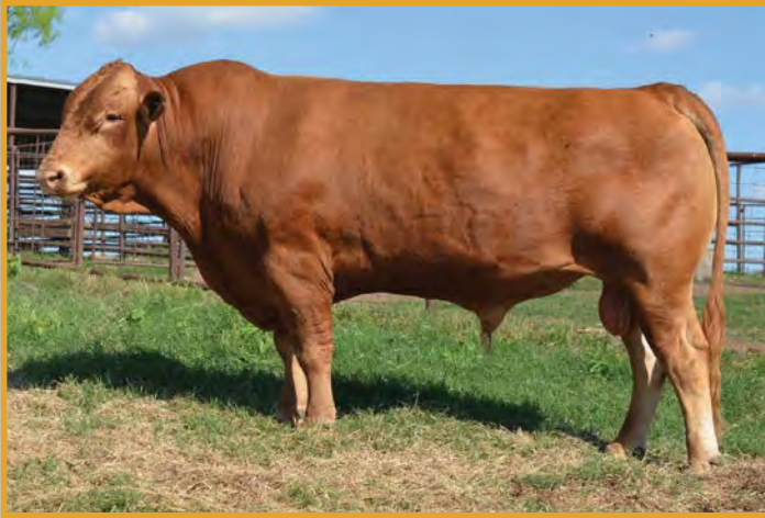
SOR BIG AL • SEMEN SELLS AS LOTS 277-279.