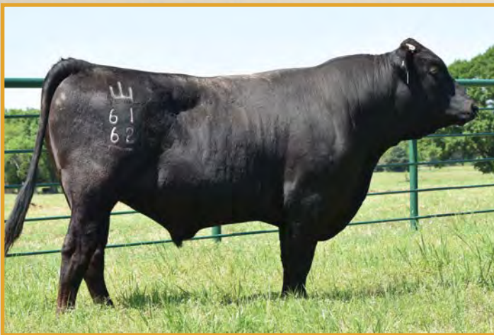
YG KINTO 6162 • SELLS AS LOT 75.

This bull goes back to some original, powerful genetics. Very strong Takeda genetics in him. Kinto is a sire that puts muscle and depth to his offspring. The dam goes back to one of our original donor cows Hikokura 1/9 and with Itohana 2 sire, this mating makes for an outstanding animal. Free.