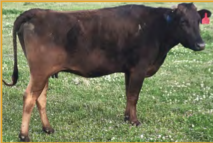
LAR MS YASIMBO • SELLS AS LOT 18.

In her first flush she gave 14 grad 1 embryos.