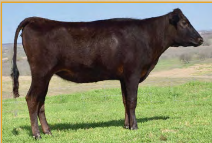
JC MS KIKUYASU 231 • SELLS AS LOT 12.

PE to SRS HARUKI 101 and SRS HIRASHIGE 101, Ultrasound safe 85 days on March 23, 18, likely a Heifer Calf (DNA to determine sire) LAR MS SANJIMBO'S (FB 18351) great-grandfather, JVP Hiratafuji 402 (FB2116), is possibly the only 100% Fujoshi bred bull available outside of Japan. Add to these phenomenal genetics World K's Sanjiro, arguably one of the most popular sires in the Wagyu industry, well-known for size and power, coupled with World K's Michifuku marbling and carcass quality offered on the dam side, and you have a young female with years of breeding to add to your herd! Sells pasture exposed to both SRS Hirashige 101 (FB23025), a son of Westholme Hirashigetayasu z278, and also to SRS Haruki 101 (FB24135), a son of World K's Haruki 2. More than likely expecting a heifer as no male genitalia seen in ultrasound as of March 23rd (approximately 85 days in calf on that day).