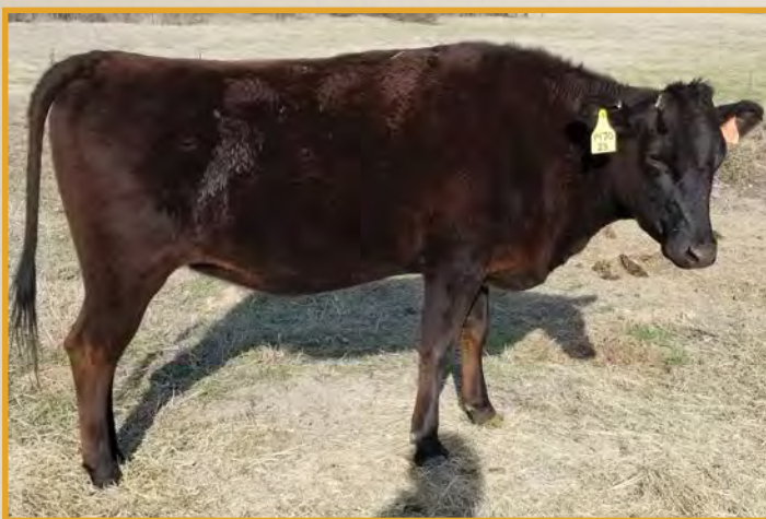
BZ HARSHIGE 003C • SELLS AS LOT 13.