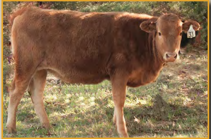
BLF MS GALAXY RUESHAW II 02E ET • SELLS AS LOT 20.