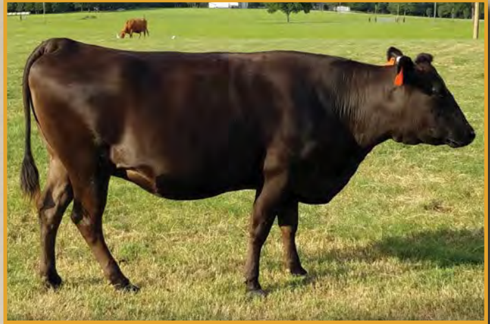
BLB MS KUIHO 1206 • SELLS AS LOT 9.

Own daughter of World K's Michifuku and out of JVP Kikuyasu 400 on maternal side. This cow is big and long with a bloodline that can get all the marbling you want for beef production or beautiful females for seed stock production. She had good milking traits and can take care of big calves. She is bred to an AA5 Shigeshigetani son FB14092 with Sanjiro grand sire, followed by 068 and Kitaguni Jr. as great grandsire! So you will not be disappointed with her calf, male or female. We will also breed her back to FB14092, should you desire.