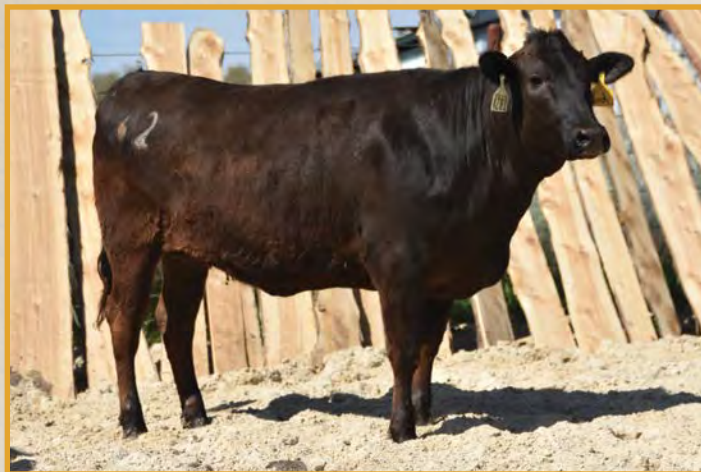
TR MS SHIGEKEMI 62D • SELLS AS LOT 31.