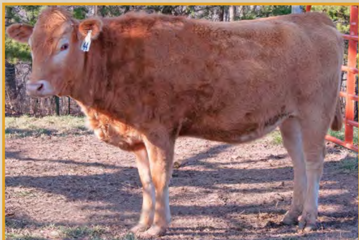
BLF MS HENSHIN III ET • SELLS AS LOT 27.