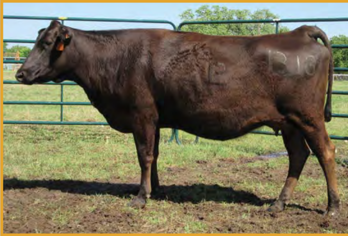
BLB MS SHOKAKU 1318 • SELLS AS LOT 6.