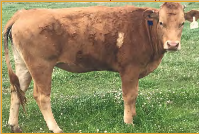
BRW LEOTIE 011D • SELLS AS LOT 23.