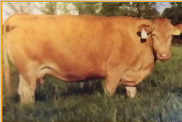
JVP MS HOMARE J 30E • DAM OF SOR BIG AL.

Here he is! High selling bull red or black of the 2017 Texas Wagyu Sale last year! AND CSS so you can make export eligible embryos!!! With an impeccable pedigree and phenotype, SOR Big Al influence will pay dividends for many years. This pedigree and phenotype need no introduction. The J 30E cow is widely considered the greatest akaushi cow in the AWA registry.