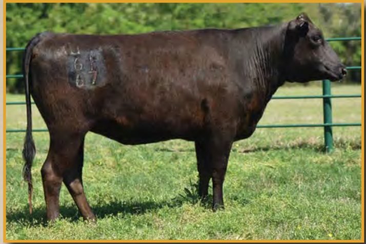
YG 6167 • SELLS AS LOT 38.

YG 6167 has some really powerful genetics. Sired by a bull that goes back to the great Kikuterushige and Itomichi 1/2 making great milking and size for offspring. On the bottom you will find the foundation bred animals Dai 2 Kinntou 2 and the great marbling bull Terutani. This heifer's pedigree speaks for itself.