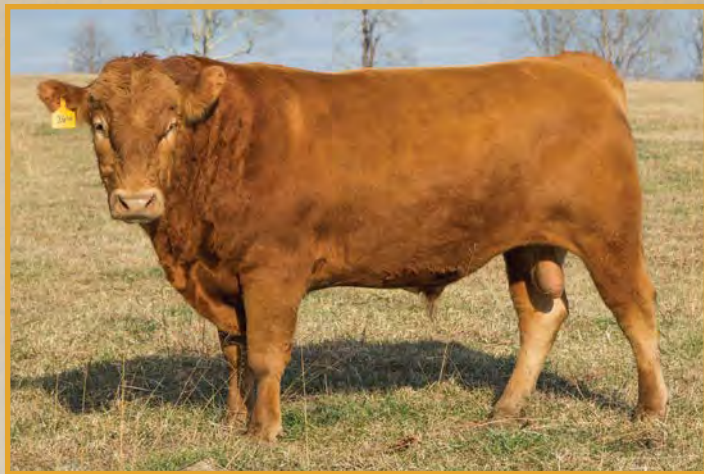
CF RUESHAW 26W • SELLS AS LOT 83.

Make sure you bid last on this great offering!! This is a virgin Bull ready to breed!