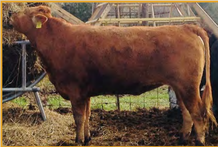
SOR 1065 • SELLS AS LOT 19.

LAR MS YASIMBO (FB18546) adds exceptional genetics to your herd. Included in her bloodline on the sire side are legendary Lone Mountain Ranch Yojimbo (FB67610) genetics and on the dam side, JVP Fukutsuru 068, arguably one of the most well-known sires in the history of Wagyu genetics. JVP Fukutsuru 068 led in the 2006 U.S. Wagyu Sire Summary (published by Washington State University). The mix of production, marbling, size, and milking is second to none! Sells open.