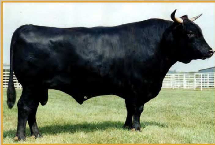
TF ITOMICHI 1/2 • SIRE OF HOH TSUNAMI 54B.

Black, Horned, Fullblood FB23119 Consignor: WAGYURANCH.COM