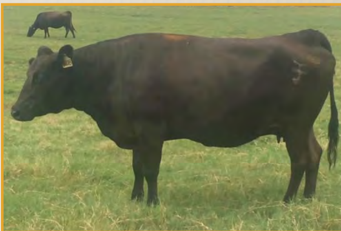
UKB JVP CHISAHIME 208 • DAM OF LOT 240.