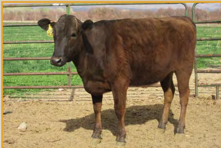
LDZ TAKAFUKU 10E AI • SELLS AS LOT 33.

This nice heifer is out of my young cow, LDZ Takanatsu 2113, who has a very nice pedigree including World K's Takazakura, CHR Kikuhanaime, and JVP Fikutsuru 068. The sire is 005 Shigefuku 13M who is a well known bull who will bring growth, marbling, and the reason I used this bull is he will add milk to his heifer calves.