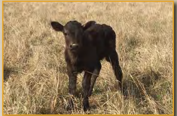
WJB MS BEJIROU 202F ET • SELLS AS LOT 51.

Sells Open KB Bejirou (FB1788) x JB 100 Fukukane (FB8298). Bejirou is a bull that has virtually no semen available, and what is available can sell in excess of $2500. Bejirou is sired by Harkuki 2, who is starting to become one of the top trait leaders in this breed. He is full brother to Genjirou and full brother to Fujiko, the first Wagyu born in the US. The dam JB 100 Fukukane (FB8298) brings size and is a top donor, averaging 21 embryos per flush. She has great size and an SCD score of VA-9. She has a strong pedigree that includes World K's Michifuku, TF Kikuhana, and World K's Takazakura. DOB was 2/14/2018. We will care for this heifer until 4 months of age and will provide transportation free of charge to your location up to 500 miles away.