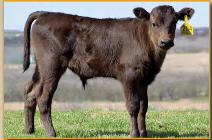
SELLS AS LOT 1A.