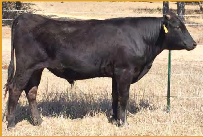
BRW BOGART 009D • SELLS AS LOT 73.