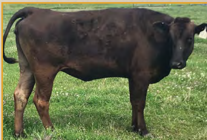
LAR MS HIRIBAR 12P • SELLS AS LOT 16.

LAR MS HIRIBAR 12P (FB20277) brings the combination of World K's Sanjirou on the sire side and Hirashegeteyasu J2351 on the dam side together to form an incredible package of genetics. In fact, a daughter of Hirashigeteyasu J2351 was the top selling bred female at the Tenroc auction in 2013, and the dam of LAR MS HIRIBAR 12P was one of the top selling bred animals at Tenroc in 2017. Bring in a dynamic and proven combination of genetics, marbling, and overall predictability in progeny with this this female! Sells open.