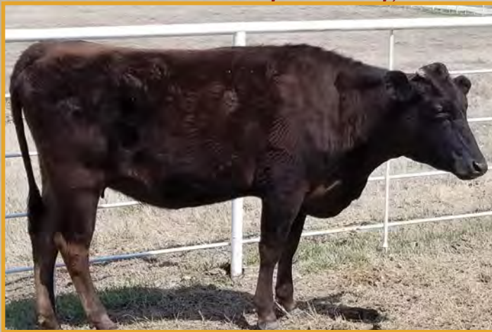
CC MS SHIGEHIME 6028 • SELLS AS LOT 35.