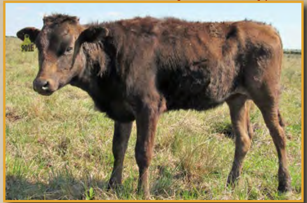
WJB MS MICHİYOSHI 901E AI ET • SELLS AS LOT 50.

Sells Open Sire is Michiyoshi 522C (FB21095) x Dam MS Yasufuku 244T-293C. Michiyoshi 522C is the only DNA verified SCD-AA 10, son of the late Michiyoshi. Michiyoshi was the #2 bull ranked free of genetic disorders in the 2014 AWA Bull Trials. The dam in this breeding was sired by Hirashigitaysu (your growth and milking bull) that brings AA-4 SCD score. On the bottom you have a daughter of World K's Yasufuku Jr., a Tajima bull with top marbling. The dam also includes Kitateruyasdoi (FB686), which brings frame along with Hirashigitaysu. All sires in this pedigree are AA on the SCD scores. Heifers DOB was 9/16/2017 and is free of all known genetic disorders. She has tested SCD AA 5.