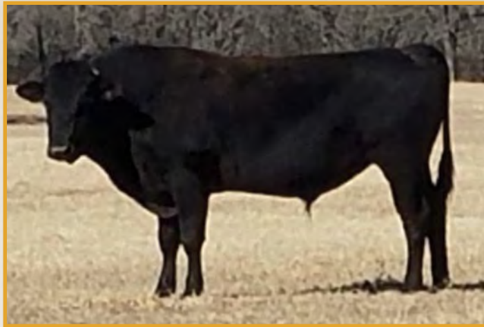
GAW SHIGSANJI • SERVICE SIRE OF LOT 9.