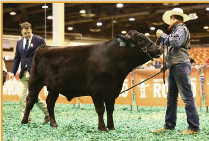
STZ ITOMAZDA D003 ET • SELLS AS LOT 72.

STZ ITOMAZDA D003 is a very nice, well bred bull ready to go to work. His grand dam on the maternal side is Briggs Beppu. Loaded with high marbling and fantastic carcass qualities from 068 & Michifuku. Mazda and TF Itomichi brings growth, frame and milk into the pedigree. At 20 months old ultrasound showed him having a 16.17 sq. in REA, 5.26 marbling score and weighing 1250 lbs. This bull has a beautiful top line, deep chested, with plenty spring of rib. He is sure to bring value to any program.