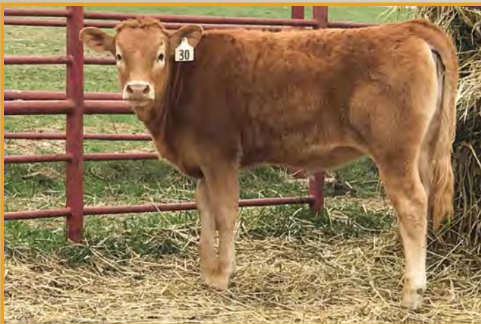
JMK KIMIKO 223E ET EMPRESS BEAUTY • SELLS AS LOT 25.

Like BRW Bonita 010C, this lot (FB 26446) offers some of the most well-known red genetics in the industry. She is progeny of HB Red Star and HB Big Al to name a few of the animals in her bloodline, and she brings your herd the sort of red genetics that continue to dominate the industry today. A young animal, she will add value and quality for many years to come in your herd. Sells open.