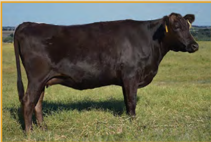
JC MS SHIGEFUKU 109 • SELLS AS LOT 5.

A tremendous brood cow. Foundation genetics on both sides (Shigefuku x Itoshigenami) gives her special value, with a powerful combination of marbling and milk. Maternal grandsire is highest ranked foundation bull for marble score and sire is highly ranked for frame, milk, and fertility. Because she comes from the "Nami" line, she can be safely bred to any Tajiri line sire for the ultimate in carcass quality.