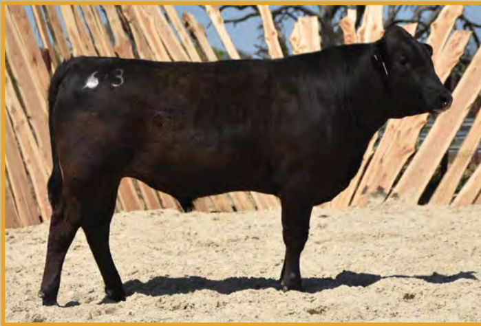
TR SAN TANI 63D • SELLS AS LOT 61.