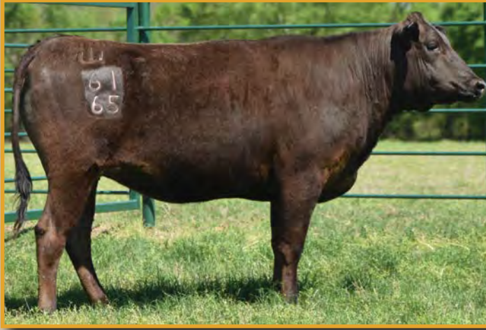
YG 6165 • SELLS AS LOT 29.