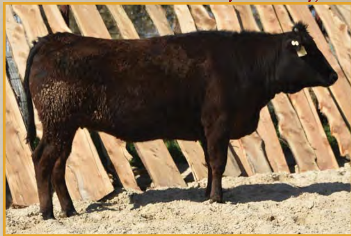
BAR V NAKAGISHIRO 55D • SELLS AS LOT 44.