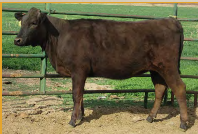
LDZ HOROJIRO 26E • SELLS AS LOT 48.

Sells Open This is an outstanding feminine heifer offering a great conformation and gentle temperament. Due to her outcross of Black Wagyu genetics, she offers flexibility in any breeding program. She is sired by Md. Mucho TF37 (Kikuhana), a Grand Champion Bull at Houston Livestock Show, that is a powerful bull possessing exceptional growth genetics. Equally impressive is the dam's genetics that include World K's Yasufuku Jr. (FB5061), Itomichi ½ (FB2126), and Mazda (FB103). You can expect that this uniquely bred heifer will generate remarkable marbling, possess outstanding milking capabilities, and will provide exponential growth opportunities. Free of all known disorders.