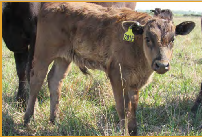
WJB MICHİYOSHI 201F ET • SELLS AS LOT 95.