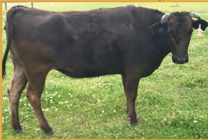
LAR MS SANJIMBO • SELLS AS LOT 11.