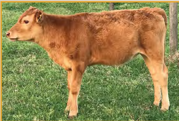
LRX MS RED STAR 0819E-29E • SELLS AS LOT 57.

This young heifer brings pedigree checked full of proven performance. She's young, sturdy framed, and ready to work. With a who's who of marbling and maternal proficiency in her genetic composition, she's a can't miss herd cow in the making.