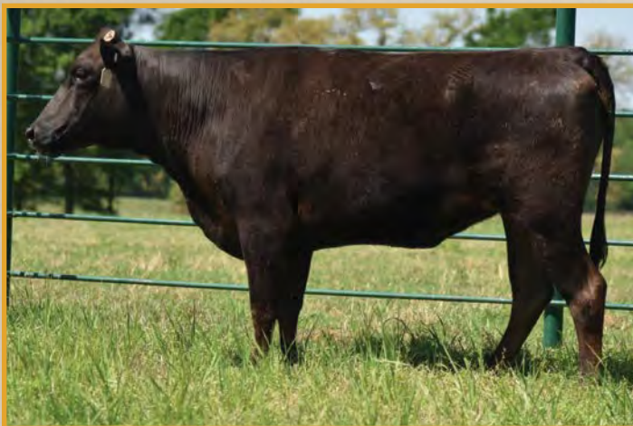
YG ITOMICHI 6154 • SELLS AS LOT 36.

Sells Open This great young female had a perfectly healthy heifer calf at side but died a few weeks ago from a virus. This awesome breeding animal is packed with a powerhouse pedigree from a Hirashigetayasu sire to a Shigeshigetani dam. She also has Bar R 12P which the 2017 LMCC Sire Performance Study ranked as the #3 dam sire for ribeye area.