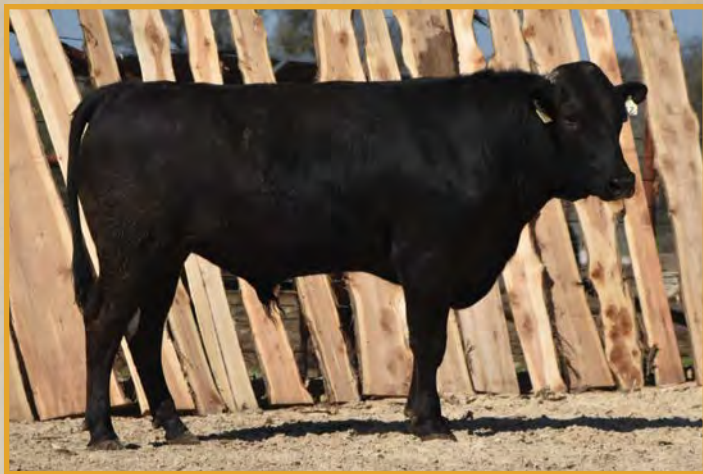
BAR V NAKAGISHIRO 56D • SELLS AS LOT 64.