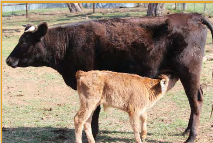
R-W48C • SELLS AS LOT 4.

3A Bull Calf born 1/25/18 sired by TUR Itomichi Emperor (FB17796) Rosewood Llano offers R-48C (AI) (FB23498)- A young 2 ½ year old registered female sired by Red Emperor (FB14999) with MS Tahio (FB15193), a Michifuku daughter with strong Tajima bloodlines. R-48C is tested free of genetic defects. She has a bull calf, W121F by her side, sired by TUR Itomichi Emperor (FB17796) giving him a strong red/black pedigree, DNA verified.