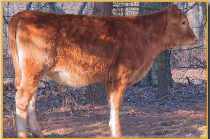
BLF MS GALAXY RUESHAW III 03 ET • SELLS AS LOT 21.