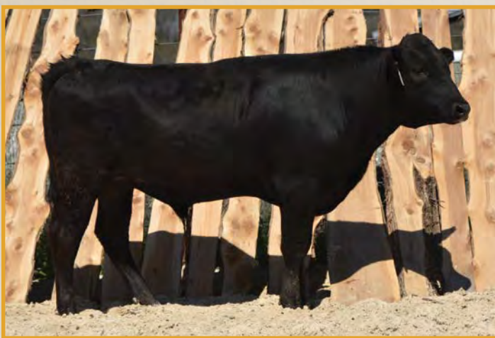
RGR MT MICH D225 • SELLS AS LOT 63.