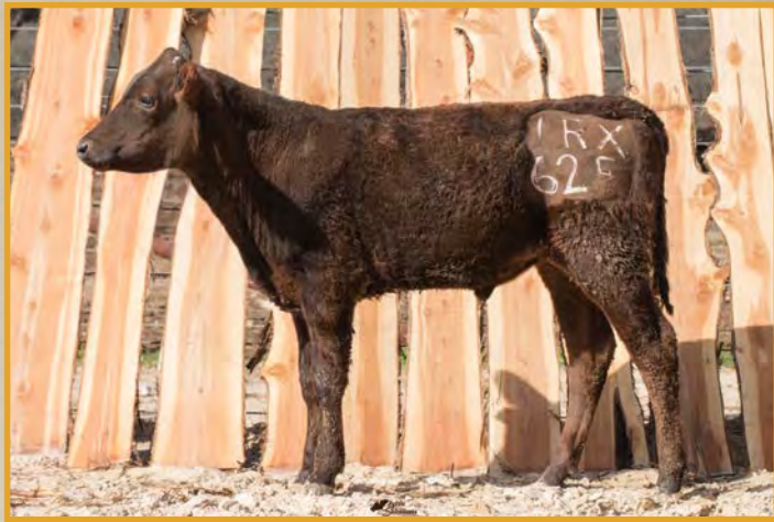
LRX YASUMICHI 0715E 62E ET • SELLS AS LOT 70.

This bull has been tested free for all known Wagyu genetic defects. His SCD result is AA and his Tenderness Score of 7.