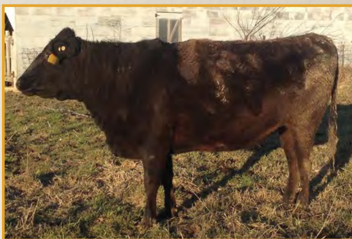
UKB MS J84-156EM • DAM OF LOTS 206, 207.

Sired by "Mazda" the only 100% pure "Yuhou" line tottori bull to ever leave Japan, these rare embryos will have extreme growth of both Mazda and the famous Takazakara 101L bull, with Kikuhana top and bottom in the Dam's pedigree! Kikuhana was a monster 2600+ lb fullblood who's influence carries long and deep into his progeny. Rare opportunity to get the outcross genetics of Mazda combined with high growth Shimane blood. Don't forget about Yasutani Doi and Bejiro's full sister "Fujiko" high powered tajima genetics tucked away safe and sound and obvious in the dams pedigree.