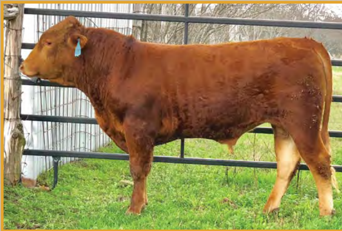
RGR RUEMARU D213 • SELLS AS LOT 79.