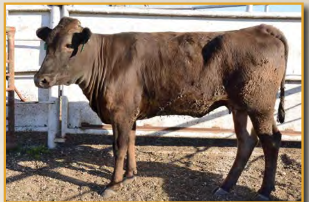
BSF YONJITSUTSU 45 • SELLS AS LOT 53.