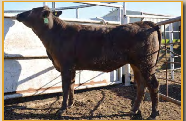
BSF YONJUICHI 41 • SELLS AS LOT 52.