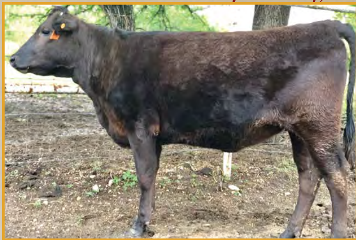
RGR MS SHIGEVE E261 • SELLS AS LOT 32.

Phenotypically the top heifer we have produced, E261 is a combination of rare genetics that will add value to any fullblood herd. She is homozygous for the preferred SCD allele (AA) while showing powerful growth and marbling all built into one package. She is open and ready to breed or flush.