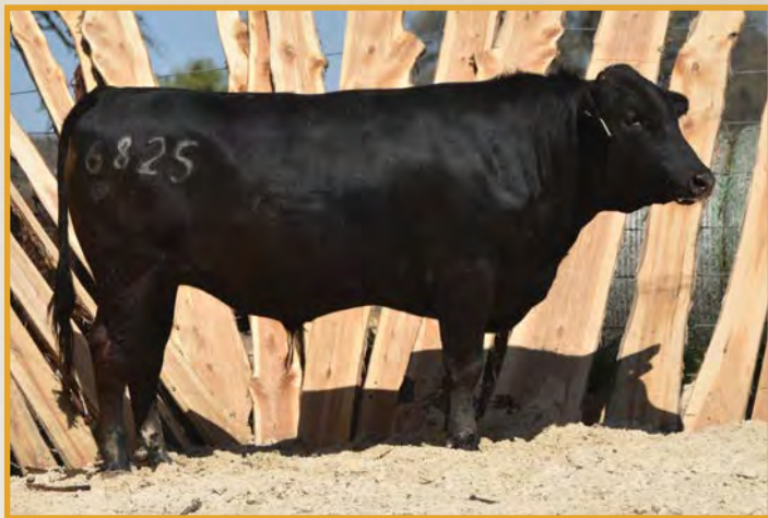
TR SHIGEFUJI 6825D • SELLS AS LOT 60.