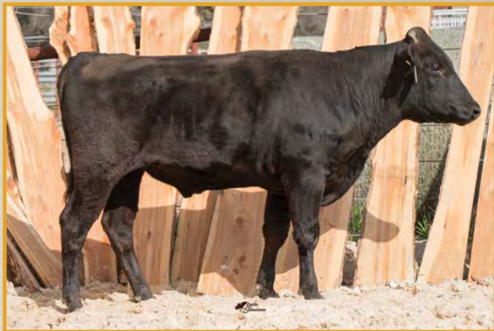
LRX YASUFUKU 0921D 45D • SELLS AS LOT 65.