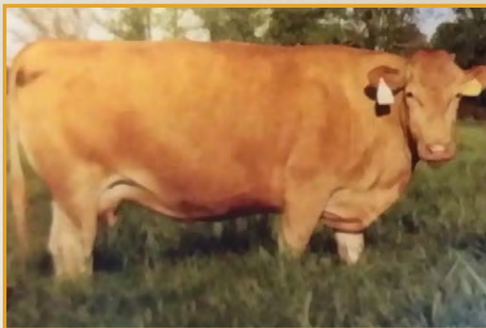
JVP MS HOMARE J 30E • GRANDAM OF LOT 228.