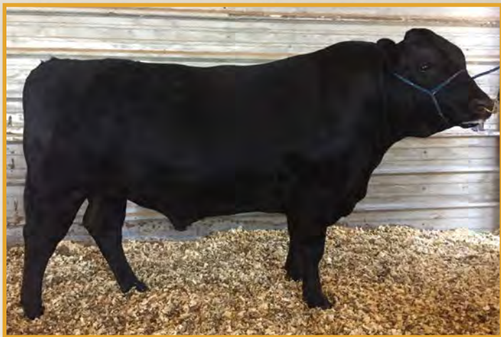
TUR RED ITOMICHI 50 • SELLS AS LOT 86.

If you are looking for a bull that will produce large carcasses with marbling then this is your guy. He is a thick, highly muscled bull with depth and definition and had a birth weight of 60 pounds. His pedigree from the Sire side is Heart Brand Red Emperor who is from the famous bull Heart Brand Big AI. Red Emperor has been proven to sire cattle with good growth and good dispositions. Red Emperor has also shown he can sire offspring with excellent marbling. On the dam side of the pedigree is TF Itomichi 1/2, Takazakura and Fukutsuru. TF Itomichi 1/2 whose genetics are widely used for producing consistently large quality carcasses, increased milking abilities, mature size and growth rate without reducing marbling. Takazakura has proven genetics with 1200 F1s fed 540 days ADG 1.87. 68% graded 9+ on the Australian scale. This is 3 full grades above the highest prime on the USDA. 22% graded 7-9 which is prime and prime +. Fukutsuru is the previously ranked #1 marbling sire in the U.S. Sire Summary. Take a look at this bull and I am sure you will be impressed.