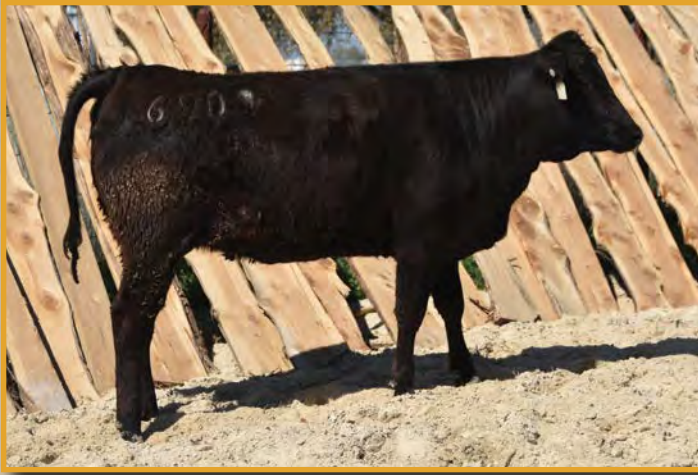
TR MS ICHIRARUKI 6909D • SELLS AS LOT 41.