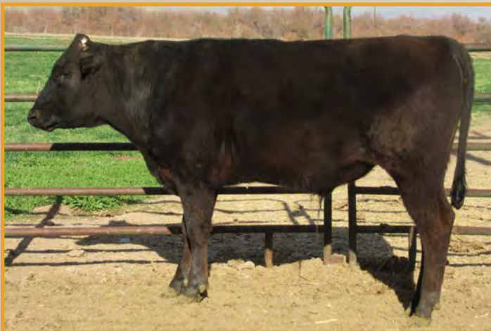
LDZ SHIGENATSU 18E • SELLS AS LOT 88.

Offering the best of both worlds with this half red / half black bull. Get the size and growth from sire, HB Red Emperor, a son of Akaushi great Dai 8 Marunami. From the maternal line, you'll get the breed leading ribeyes / marbling from Sanjiro, leading straight into the maternal line of Okutani. We have ultra sound data to back up the ability for this bull to marble! We have had several full brothes to ultra sound beyond prime and pictures of ribeye to back up carcass data. A combination of two renown cow families in this one exceptional animal.