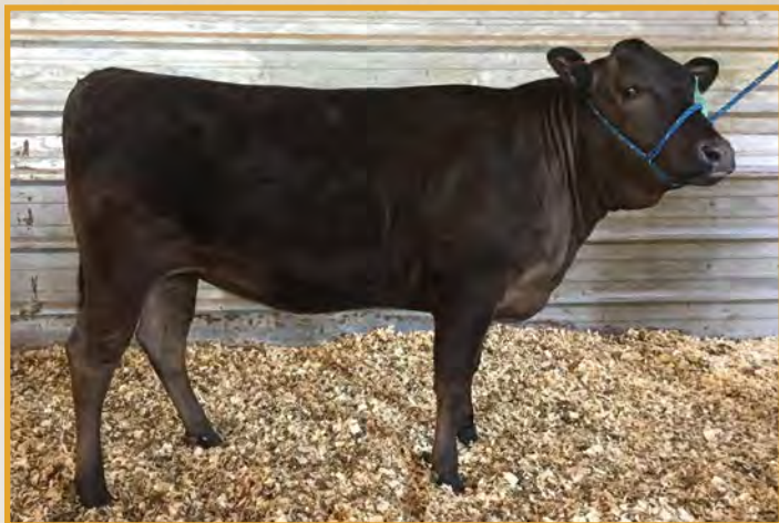
TUR MS SHIGE YAS 64D • SELLS AS LOT 34.

A young heifer that measured Prime (8.08) via ultrasound with only 4mm of back fat and a rib eye of 13.58 square inches at only 18 months of age. This heifer has length, volume and capacity to make a great cow. The pedigree for this heifer is one for high marbling with a high percentage of the Tajima line. Her bloodlines include Shigeshigetani, Michifuku, Suzutani, Haruki 2, and Fukutsuru from the Sire side. Shigeshigetani has some of the most powerful genetics in the Wagyu breed and carries the Kumanami strain. The Kumanami family is known for its extremely potent marbling genes. This heifer has Yasufuku Jr., JVP Kikuyasu-400 and Michifuku from the dam side. Yasufuku Jr is also known for marbling and Kikuyasu-400 has the reputation for adding size and quality of the carcass. If you are looking for a cow that will add marbling and can be the cornerstone for your herd then this is your female. She sells open and ready to flush or AI.