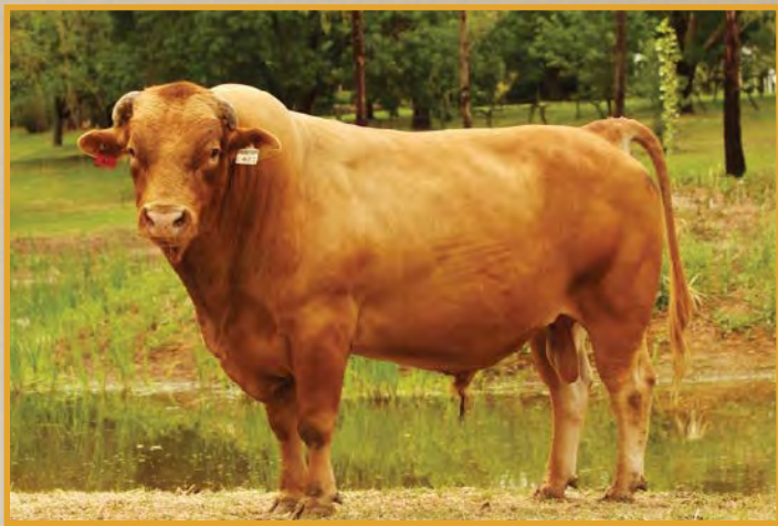
KALANGA RED STAR • SEMEN SELLS AS LOT 273.

This is the bull that started the current Red movement for V-V Wagyu. He is the sire of VBV ROA Red Galaxy who was sold to Sexing Technology and has produced many thousands of carcasses in Central and South America, as well as many show calves. He also sired the record setting $44,000 heifer as well as many Grand and Reserve Grand Champion show cattle and those looks have carried on through his son Red Galaxy. This is the last 7 straws from the same shipment that produced these great cattle. He is very correct in type, as well as feet and legs. His calves grow extremely well and have good feed conversion.