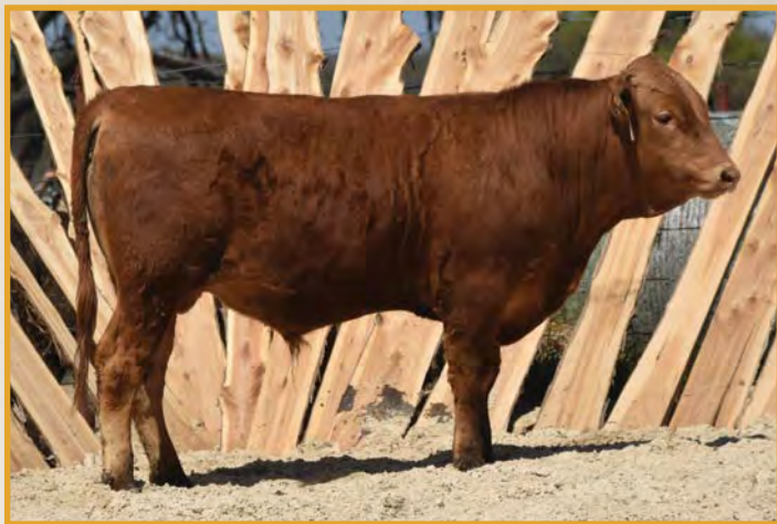
KR GALAXY RUESHAW D906 • SELLS AS LOT 78.

Sired by the UKB bred bull, VBV ROA RED GALAXY, who is also SCD AA. Red Galaxy is part of ST Genetics Bull Battery. The dam, is IWG MS RUESHAW 75Z, the first daughter of Rueshaw registered in both the American Wagyu Association and the Akaushi registries. 75Z sold for $10,500 at last year's Steaks are High sale. All the major red bloodlines can be found in this bull's pedigree.