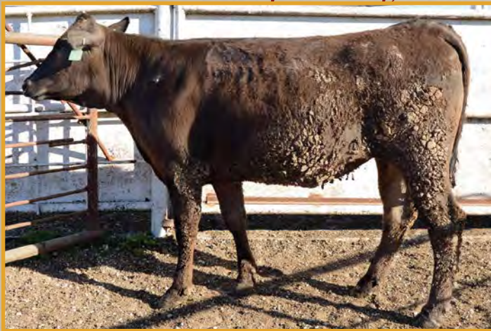
BSF YONJITSUTSU 42 • SELLS AS LOT 54.