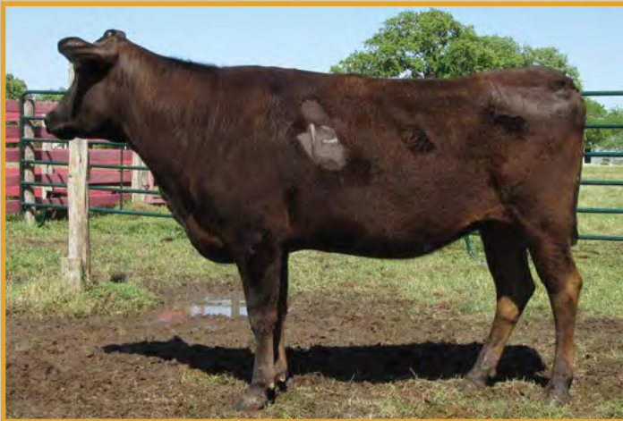
BLB MS SHOKAKU 1425 • SELLS AS LOT 7.