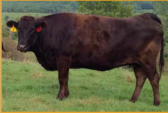
NANASHI • DAM OF LOT 221.