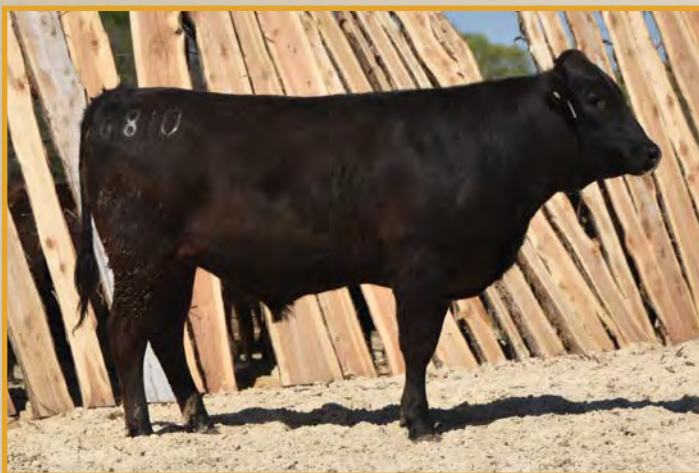
TR SANJIKEMI 6810D • SELLS AS LOT 62.