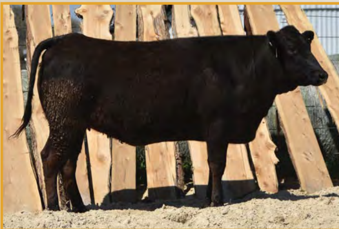
BAR V SHIGESHIGETANI 57D • SELLS AS LOT 43.

If you are interested in adding a distinguished foundation bred heifer to your herd, going back to Taekada Farms imported cattle, this is the one for you! Her sire goes back to Itomichi and Kikuteri Doi, known for their exceptional growth and milking capabilities. The sire also has Itoshigenami known for superb marbling. Her dam goes back to Itoshikari (FB573), Itomichi (FB500), and Itoshigefuji (FB3681) providing outstanding growth & size in addition to proven milking abilities. Additionally, she has Itoshigenami (FB3682) known for remarkable marbling and ribeye. This exquisite heifer is double bred Itomichi (FB500) and Itoshigenami (FB3682). She would be a great addition to any breeding program. Free of all known genetic disorders.