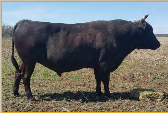
JC YASUTANI 068 TEX 8126 • SEMEN SELLS AS LOT 261.

The AWA begin testing for recessive genetic disorders in 2010 when it was discovered that the foundation bull JVP Yasutanisakura carried 3 of the 4 disorders, his valuable blood line hit a wall. There are currently 99 registered progeny and only one who is free of all of the disorders. This is the one!! Having another carrier, foundation sire as his maternal grandsire, Fukutsuru 068, it's a miracle that this bull is disorder free. Since, as he is known, was entered in the 2010 Texas Bull Test where he ranked in the top 17% for average daily gain and ribeye area, with above average marbling. In limited fullblood production his average birthweight is 58 pounds. His pedigree is approximately 55% Tajima, 30% Itozakura, ___% Shimane and 15% other for a balance of marbling, growth and milk. This semen presents a unique opportunity to widen your genetic base with no risk of disorder affected calves.