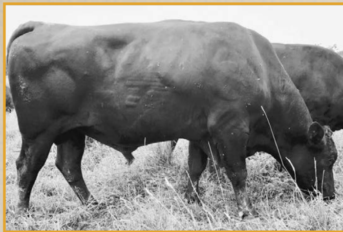
TAJIMAX • SEMEN SELLS AS LOT 313.

Tajimax is the largest full blood wagyu we have seen anywhere period, and may be the largest framed high Tajima (63%) bull in the world outside Japan! If anyone out there has a higher growth performing 63% Tajima, please send us semen ordering info! Every wagyu breeder who has seen him in person to date says he is BY FAR the largest full blood wagyu they have ever seen. It is by sheer luck and coincidence that he happens to be high Tajima as well... A true freak of nature weighing 2000+ lbs at two and a half years old, this bull is the final answer to the ancient wagyu breeder's quest to somehow find a way to increase frame and growth without losing Tajima percentage. Use Tajimax to revolutionize the frame & growth curve trajectory of your herd WITHOUT SACRIFICING TAJIMA PERCENTAGE! Now we have a way to straighten out all those shorter, smaller framed, 800 to 1100 lb high Tajima cows in our herds to get those super fancy, thick boned heifer calves that grow up into 1400+lb fullblood mama cows. Tajimax calves average 70+ lbs and are significantly larger than any other bull we have ever used. The increased calf size notwithstanding, even a 900 lb fullblood wagyu cow owned by ReserveCattleCompany.com calved out one of his long legged, long spined, 80 lb calves without any problems. Gettin' tired of the fugly black jersey look in your fullblood herd? Tajimax is the antidote!