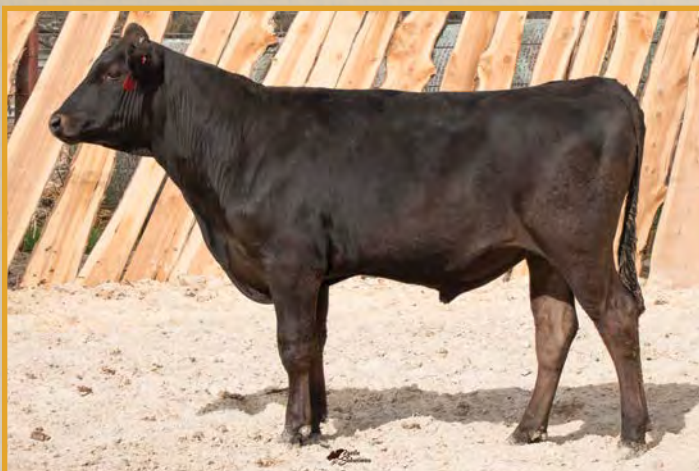
WDT WAGYU 100 MT FUJI E23 • SELLS AS LOT 68.

BW, 53, Adj. 205 day weight of 542 lbs. Ultrasound IMF of 5.79 and REA of 12.7 on 1/12/2017. He tested 8 for tenderness and VA for SCD. M6 Shigeshigetani 5162 is a high marbling, high tenderness, high performance herd sire who is very well made and has calving ease credentials. In fact we used him in the very disciplined M6 breeding plan last year. He is sired by Bar R Shigeshigetani 30T who proved to be #1 for REA and CWT, #2 for back fat and #8 for marbling in the 2014 Wagyu Sire Summary. On 5162's dam side you will find attractive, well balanced cow with a nice udder. Her sire, Bar R Takasuru 1 K was tied #8 in marbling and was #4 for CWT in the 2014 Wagyu Sire Summary. 5162 is a balance for marbling, tenderness, performance, phenotype and had real herd sire credentials.