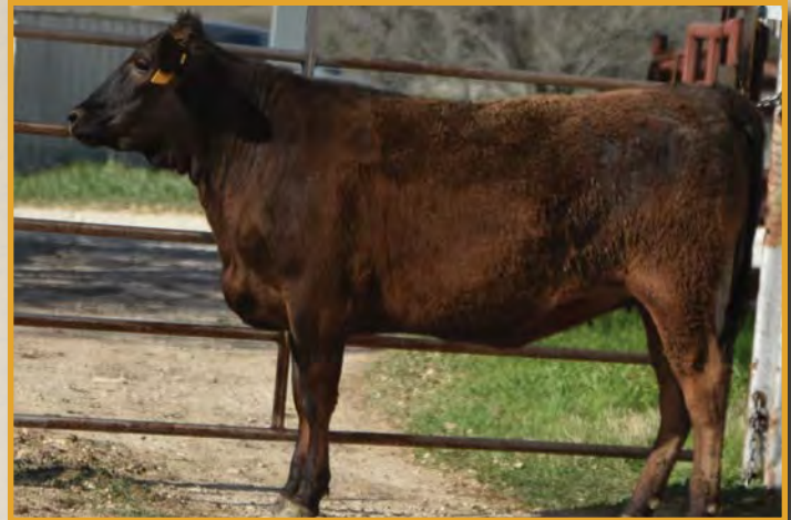
TR MS SHIGEFUGI 6033D • SELLS AS LOT 39.

TR MS 6033 is a heifer that is displaying exceptional size and growth for her age. She is a great choice as a production heifer with Haruki 2, Shigeshigetani, Suzutani, Itoshigefuji(147), and Terutani 40 :1 all appearing on the Sire side. Chihara, a Sanjirou son, sired the dam from a Mazda daughter. Sells open, ready to flush or breed.