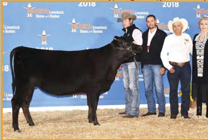
LDZ ASAKO 23D • FLUSH SELLS AS LOT 200.