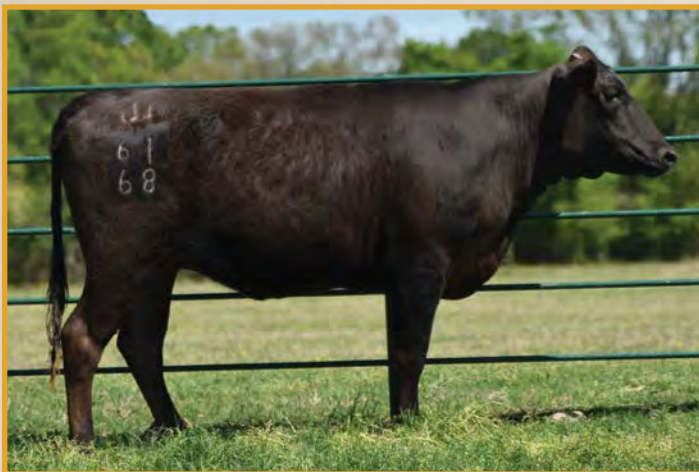
YG 6168 • SELLS AS LOT 37.

Sells Open This heifer is double bred Itomichi for growth and milking. Her pedigree represents lots of marbling going back to Terutami and Itoshiginami. This heifer will make an excellent flush cow. She has size, growth, and milking in pedigree. Free of all known genetics.