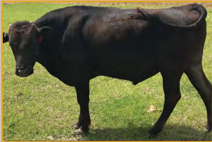
SNR HARUKI 101 • SELLS AS LOT 76.

SRS HARUKI 101's (FB 24135) bloodline includes World K's Haruki 2, World K's Sanjiro, World K's Yasufuku Jr—you get it all with this bull. The internationally recognized genetics produced by World K's Haruki 2 and World K's Sanjiro are dynamic and produce powerful progeny. Yasufuku bloodline genetics continue to be known for their marbling trait. Put all of these genetics together, and the result is SRS Haruki 101. Don't miss this one!