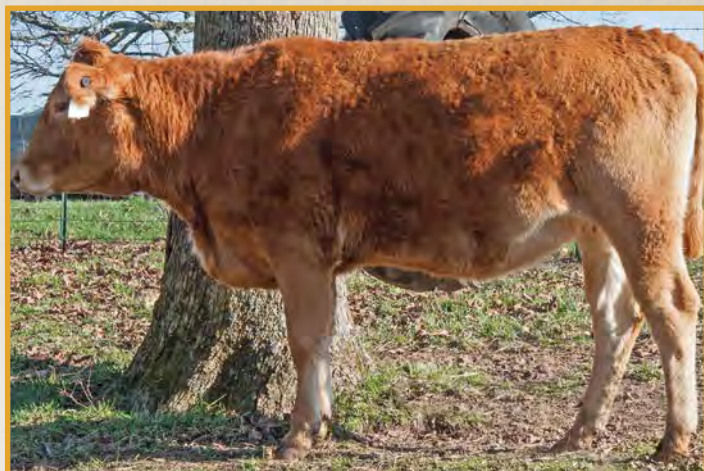
BLF MS HENSHIN II ET • SELLS AS LOT 28.