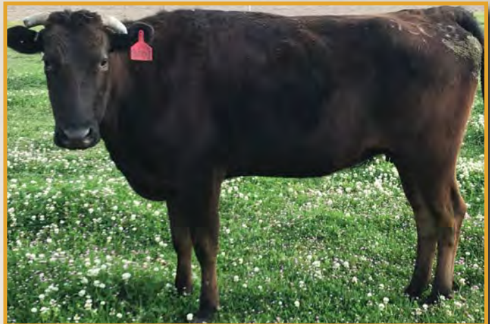
LAR MS KIRENASH 3008 • SELLS AS LOT 10.

This animal (FB18348) will be a valuable asset in your herd for years to come. Included in her blood line on the sire side are legendary Lone Mountain Ranch Yojimbo (FB67610) genetics and on the dam side, Blue Rock Michifuku. The Michifuku bloodline is world-renown for marbling and carcass quality with consistent progeny and predictability. The result is a powerful animal with marbling, size, and depth that is will add consistent quality to your herd. Don't pass this one up! Sells open.