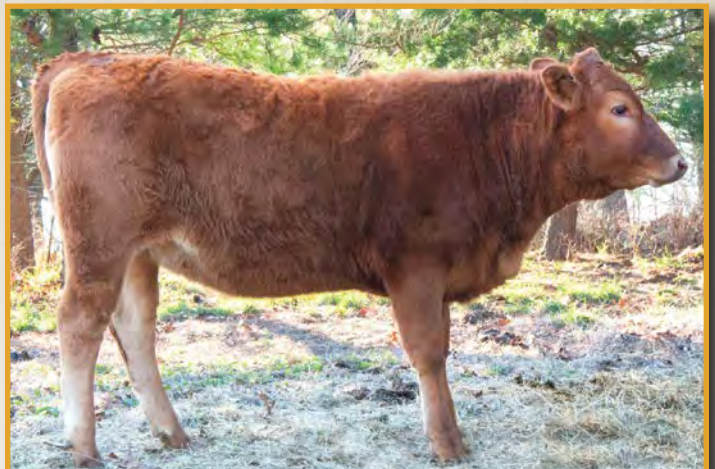
BLS MS GALAXY RUESHAW I 01E ET • SELLS AS LOT 22.