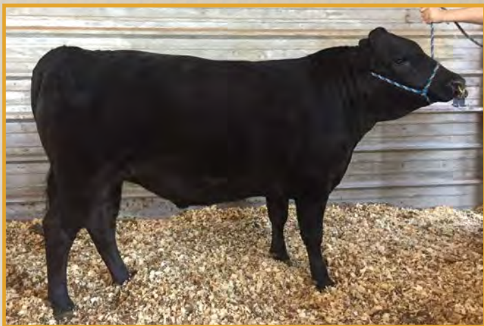
TUR ITOMICHISHIGE 60D • SELLS AS LOT 71.

This young bull measured High Choice (7.55) and a rib eye of 14.08 square inches via ultrasound. These are very high scores for a bull. He has a big, wide top and a big rib cage with a large amount of volume and capacity. A pedigree with a "who's who" from the Tajima line on the sire side. This includes Shigeshigetani, Michifuku, Suzutani, Haruki 2 and Fukutsuru. Shigeshigetani has some of the most powerful genetics in the Wagyu breed blended together in one very impressive pedigree. He is half-brother to the famous bull SANJIROU. 90% of WORLD K'S Shigeshigetani's progeny have graded a 9+ on the Australian scale, meaning 3 full grades above USDA highest grade of prime. The remaining 10% graded 7-9 on the Australian scale and this would be prime to prime + on the USDA scale. On the Dam side is TF Itomichi 1/2, Takazakura and Fukutsuru. TF Itomichi 1/2 genetics are widely used for producing consistently large quality carcasses, increased milking abilities, mature size and growth rate without reducing marbling. If you want to increase the marbling in your herd, don't miss this opportunity on this great bull.