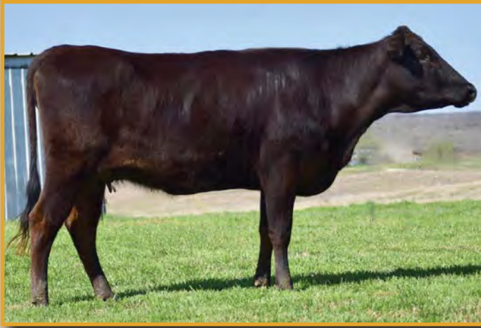
JC MS SHIGEFUKU 207 • SELLS AS LOT 1.