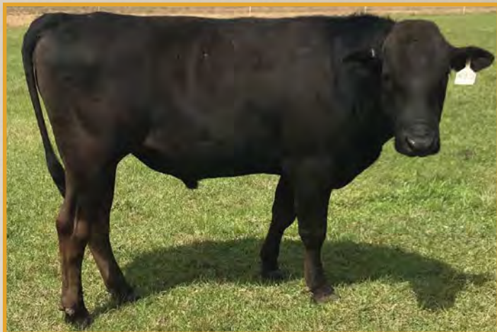
FAC TAKASHIGO • SELLS AS LOT 77.

FAC TAKASHIGO (FB23715) is one of the finest bulls offered in the market. With both Yasufuku genetics on the sire side and Hirashigeteyasu J2351 on the dam side, this animal offers incredible genetics, breeding, and carcass quality for progeny. His dam was one of the top selling bred females at Tenroc in 2017, and she is a granddaughter of Hirashigeteyasu J2351 which was the top selling bred female at the Tenroc auction in 2013. Marbling, size, and power are all packaged in this bull. Make this animal part of your herd today!