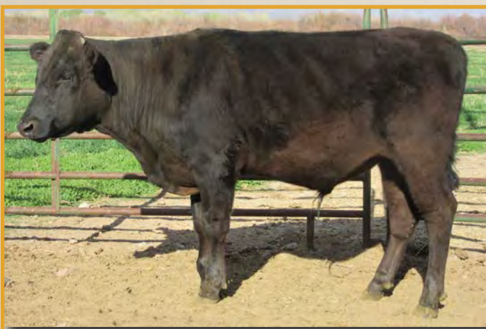
LDZ SETSUJOKU 24E AI • SELLS AS LOT 89.

This nice young bull is out of 005 Shigefuku 13M, who is known for growth, good marbling and adds milk to this heifer calves, which should carry over to 18E. 18E's dams pedigree includes JVP Fukutsuru 068, a great marbling bull. 18E will make a great F-1 bull and could be used to sure full bloods also.