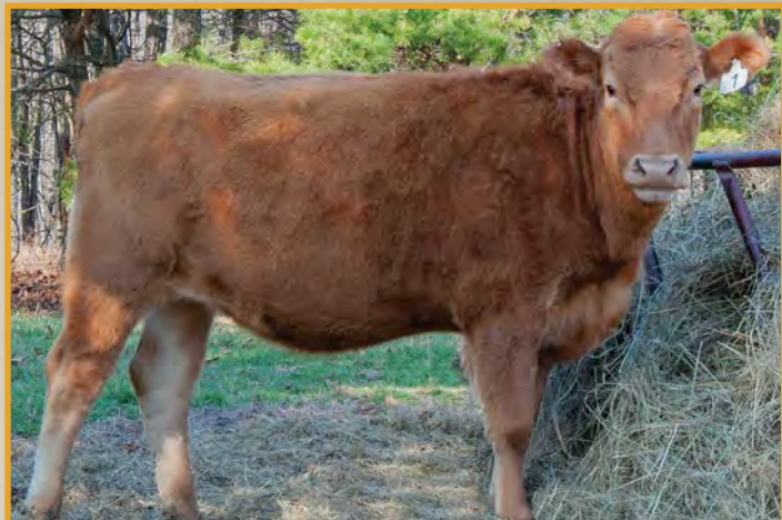
BLF MS HENSHIN I ET • SELLS AS LOT 26.