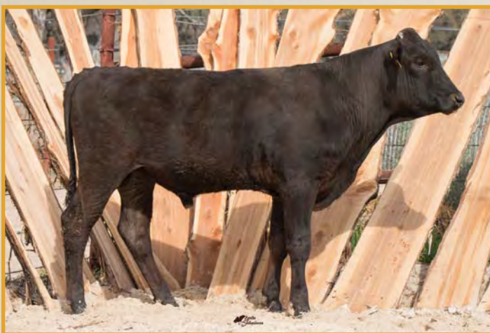
LRX NAKAGISHIRO 56T 0429E 19E • SELLS AS LOT 69.

The sire of this bull is none other than Mt Fuji, who at the time if this auction would have been 44 years old and the dam at 10. The sire of this bull's dam is none other than Itozuru Doi. This breeding has created a low COI of only 1.45% and a SCD/Tenderness of AA7. The low COI and genetics give this bull great potential as your clean up bull for your AI/Embryo program and as an AA7 will make him your "go to" for your F1 program. Currently the bull is at PX Feeders and test results will be given out through a flier. We will post our results on our website www.dorancattlecompany.com. Wagyu 100 retains 10% of the semen rights for the limited use of their breeding program.