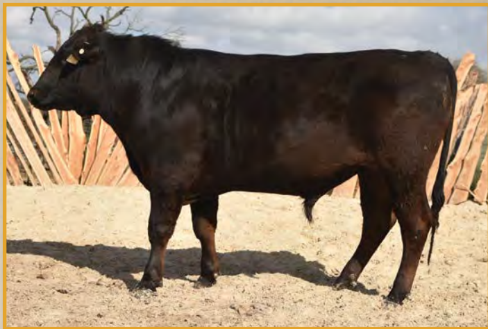
MWR KW ITOMICHI 2 1627D ET • SELLS AS LOT 58.