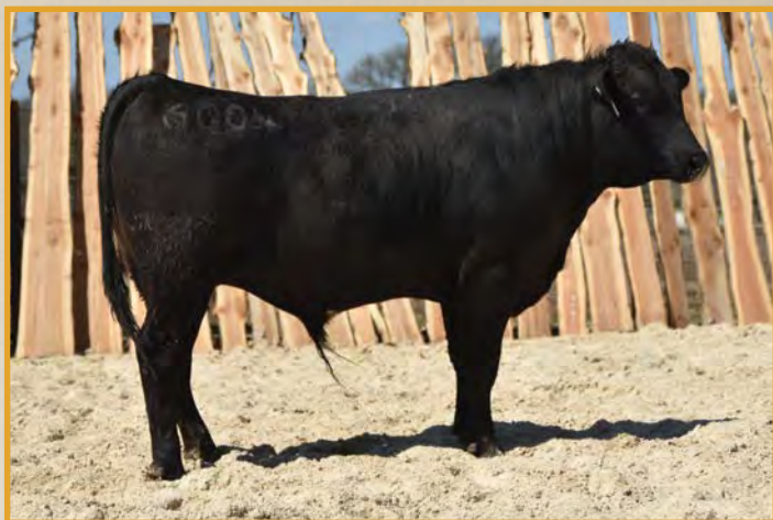
TR 151 ICHOFUGI 6004 • SELLS AS LOT 59.