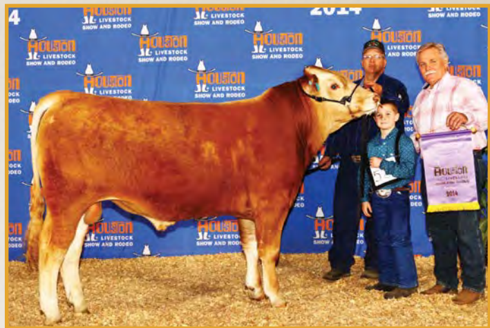
WCC CHUBBY BUDDY • SEMEN SELLS AS LOT 319.