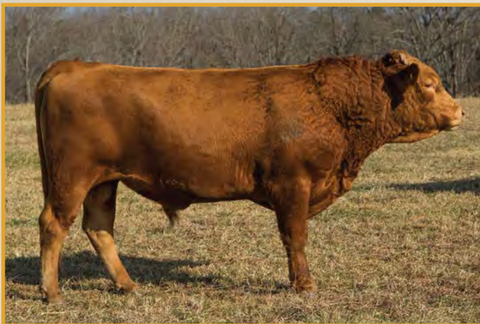
CF UMERARU 37W • SELLS AS LOT 82.

This is a Virgin bull ready to Breed! He will add growth, milk and marbling to any heard! This is a docile bull and easy to handle. Sired by IWG Umemaru 69Z, who has sired some impressively marbled FB Akaushi carcasses. The dam is sired by none other than Rueshaw himself, an early import of the 70's. The second dam is by WSI Umemaru from a Judo daughter of JVP Kunisakae. The pedigree of this animal is linebred WSI Umemaru x Judo with Rueshaw sandwiched in between. The possibilities are endless.