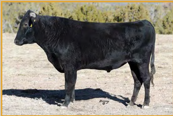
LMR KOICHI 1409Y • SEMEN SELLS AS LOT 282.

One of the most successful fullblood Wagyu bulls to come along to the Wagyu breed in the US. The LMCC Sire Summary completed in April 2017 yielded the discovery of this game changing bull. LMR Koichi 1409Y's average IMF% of harvested progeny is 33.25% ranking him #2 overall. He also topped the Sires ranked by USDA Grade in this sire summary with a score of 400. He has a marble fineness ranking of 31.56, ranking him #2. There is not another FB Wagyu sire that finished in the top or nearly top position in so many separate categories in the sire summary report. To top this off, LMR Koichi possessed a SCD profile of AA and a Tenderness score of 9, with a low coefficient inbreeding index percentage if 2.17. Additionally 1409Y is free of all genetic recessive disorders by parentage. LMR Koichi 1409Y deceased in the summer of 2017 leaving a very limited number to straws available.