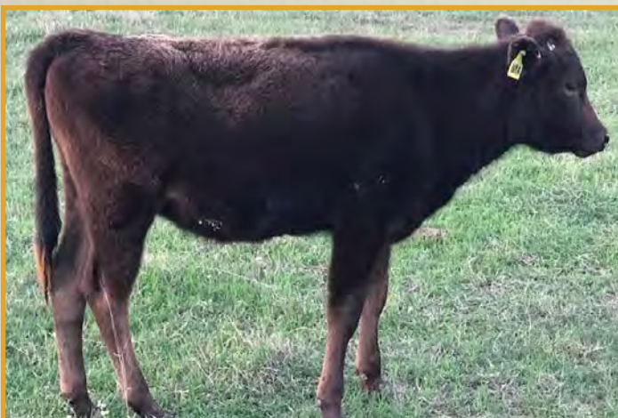
LRX MS SWEET MICHIFUKU 0726E 69E ET • SELLS AS LOT 49.