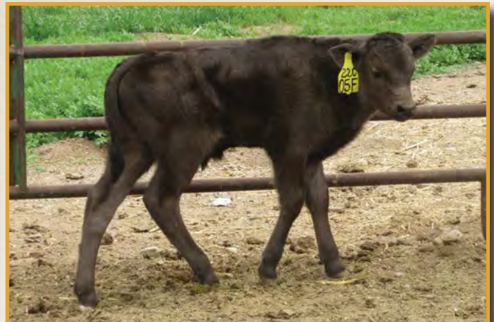
SELLS AS LOT 2A.