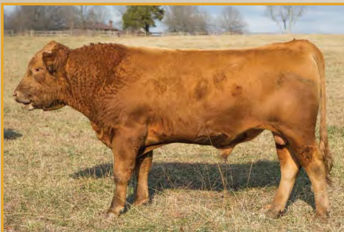
CF UMEMARU 38W • SELLS AS LOT 81.