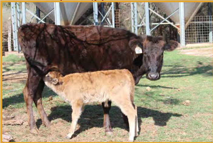
R-W36 • SELLS AS LOT 3.

4A Bull Calf born 1/23/18 sired by TUR Itomichi Emperor (FB17796) Rosewood Llano offer R-36C (ET) (FB23009). A young 3 year old fullblood black female, sired by Kitaguni Jr. (son of Kitaguni 7/8, winner of All Japan Carcass contest) with MS Tahio (FB15193) a Michifuku daughter with strong Tajima bloodlines. R-W36C is tested free of genetic defects. Her bull calf by her side, W120F is sired by TUR Itomichi Emperor (FB17796), DNA verified, will add Red Emperor and Itomichi ½ to his pedigree.