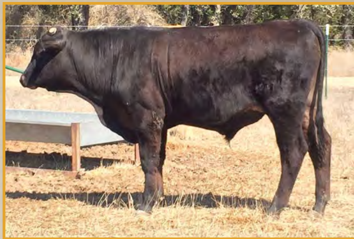
BRW RUEKARI 025E • SELLS AS LOT 90.

This young bull has ¾ red and ¼ black bloodlines. By a son of Rueshaw that has Yasajuku Jr ( whose progeny marble extremely well) in his pedigree. His dam is a really nice, very correct female with an excellent temperament.