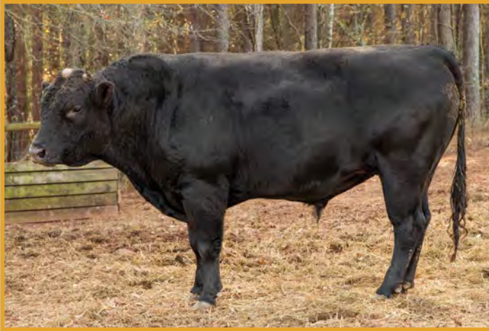
CF BLACK EMPEROR 8W • SELLS AS LOT 87.