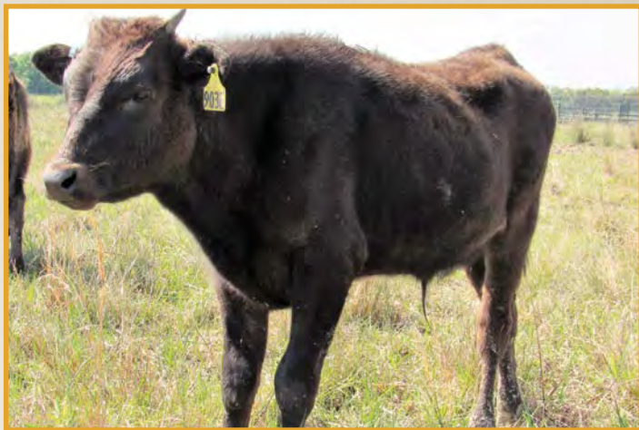
WJB MICHİYOSHI 903E AI ET • SELLS AS LOT 93.

Sire is Michiyoshi 522C (FB21095) x dam RSC MS Hirashigesuru 2115 (FB19859), Michiyoshi 522C is the only DNA verified SCD-AA 10 son of the late Michiyoshi. Michiyoshi was the #2 ranked bull ranked free from genetic disorders in the 2014 AWA bull trials. The dam's pedigree includes Harshigitaysu and a daughter of Fukutsuru 068. You also have Michifuku (SCD-AA 5) twice in this pedigree. All sires are AA on SCD scores.