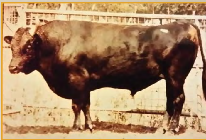
MAZDA • SIRE OF LOTS 206-208.

Danason is a cow out of the Yojimbo sire, which is a high percentage Tajima bull that boasts the classic sires Fukutsuru 068 and Yasufuku Jr in his genetics for extreme marbling and low birth weights. On her dam side, she utilizes the amazing Sanjiro for more marbling and meat tenderness and then infuses milking ability with these big name Tajima bulls in her pedigree, and adds the frame size with Kitaguni Jr.