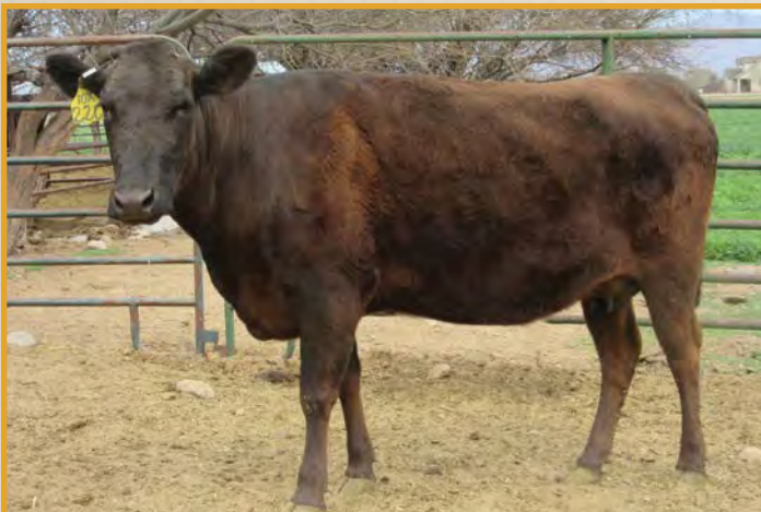
LDZ TAKASHIGEKO 22C • SELLS AS LOT 2.