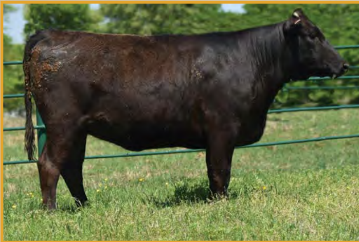
BA PRIMETIME C184 • SELLS AS LOT 42.