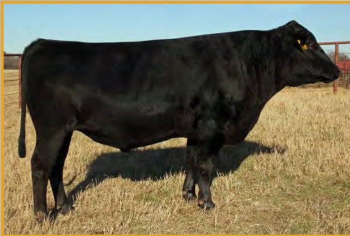
M6 SHIGESHIGETANI 5162 • SELLS AS LOT 67.