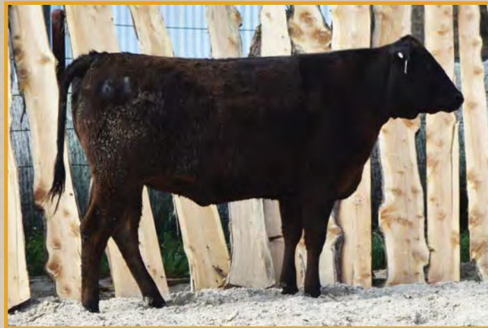
TR MS SHIGEYOSHI 6817D • SELLS AS LOT 30.

This heifer has foundation genetics and a great combination of blood lines. In the AU EBV's, her sire, Haruki 2, ranks in the top 15% or better for IMF, growth, and REA and top 5% for CW. Dam is Takada bred, which traces back to Terutami and Itoshigifji that are good foundation bulls. Free of all known genetic disorders.