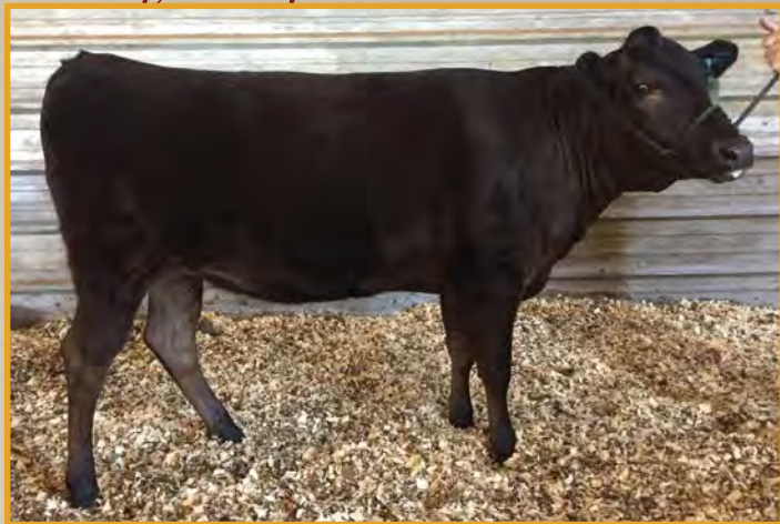
TUR MS HARUKI YAS 63D • SELLS AS LOT 14.

A young heifer that measured High Choice (7.51) via ultrasound with only 7mm of back fat and a 14.08 square inch rib eye at 18 months of age. This heifer has tremendous length, performance and growth for a young heifer. Her pedigree is for both high marbling and growth. Bloodlines include Haruki 2 and Takazakura from the sire side. Breed plan has Haruki 2 as a leader in 7 traits ranging from birth weight to growth. Takazakura is also a proven bull with over 1200 F1 prodigies with 90% grading prime or better. On the dam side this heifer's bloodlines include Yasufuku jr., and JVP kikuyasu-400. Yasufuku Jr. is the #1 ranked Dam Sire in the 2014 Lone Mountain Sire Performance Study and #2 for IMF percentage. Kikuyasu-400 is by far the largest Tajima sire ever exported from Japan weighing 1980 lbs. and holds the record for the largest ribeye area. This heifer is bred to FB25880-TUR ITOMICHI SHIGE 60D a bull that also is bred for marbling and growth. This heifer would be a great addition to any herd especially if you are looking to balance both marbling and growth.