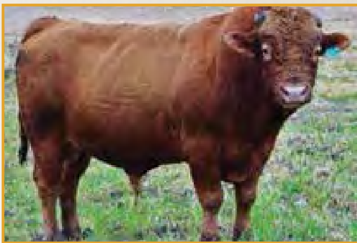
HEART BRAND RED EMPEROR • SEMEN SELLS AS LOTS 274-276.