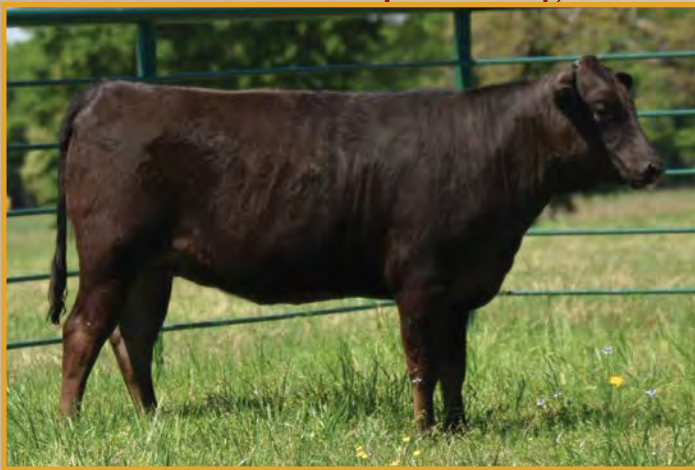
BA MS KIKUFUJI 176 • SELLS AS LOT 47.