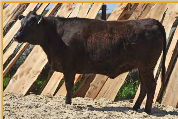
BAR V SUZUTANI 51D • SELLS AS LOT 45.