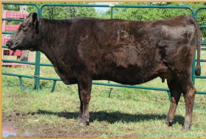
BLB MS SHOKAKU 1320 • SELLS AS LOT 8.