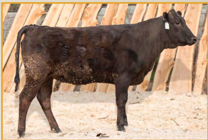
DCC MS NICHI-TIG 12E • SELLS AS LOT 46.

Sells Open This heifer is 16 months old and is ready for breeding or flushing. She has an unusually wonderful disposition and has a COI of 4.45% and a SCD/Tenderness of AA5. Currently she is at PX Feeders and test results will be given out through a flier. Results also on our website. www.dorancattlecompany.com.