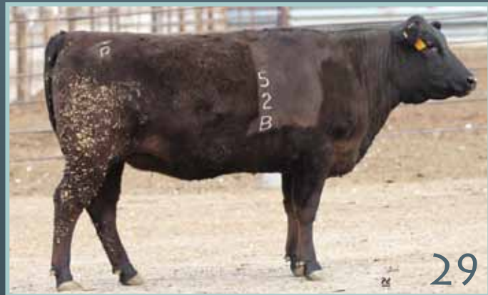
National Wagyu Sire Summary 2014