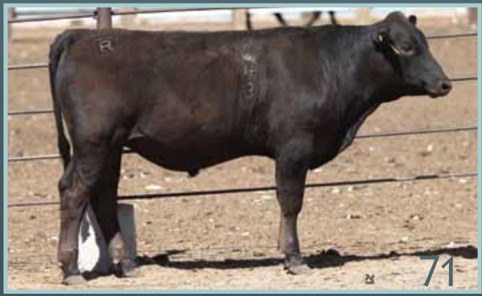
National Wagyu Sire Summary 2016