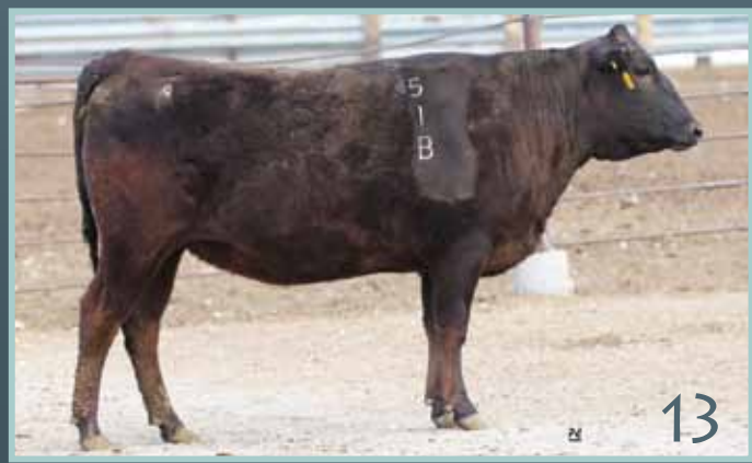
National Wagyu Sire Summary 2014

DAM BAR R MICHISURU 2 K WORLD K'S MICHIFUKU BAR R 67P JVP MS FUKUSHIGE T10E MISS BAR R 337H BLUE ROCK MICHIFUKU JVP MS KIKUSHIGE 24E