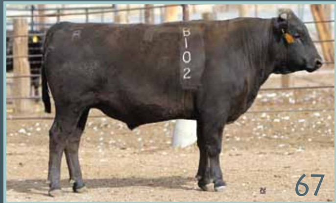
National Wagyu Sire Summary 2014

DAM BAR R NAKAGISHIRO 56T WORLD K'S SANJIROU BAR R 31W WORLD K'S NAKAGISHI 5 MISS BAR-R ARLIE RTR ONYX 77A BR MS. PINKETTE A302