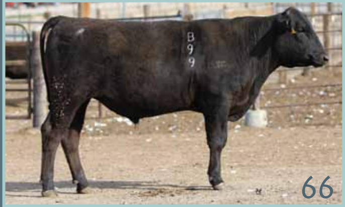
National Wagyu Sire Summary 2014