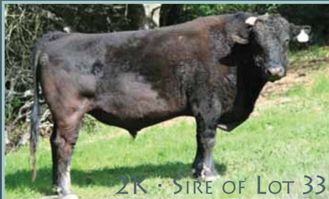
National Wagyu Sire Summary 2014