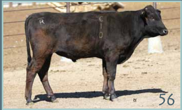
National Wagyu Sire Summary 2014

DAM BAR R 29S BAR R SANJIROU 4P BAR R 43U BAR R MISS 51J BAR R 2P BAR R TAKASURU 1 K BAR R MISS 53J