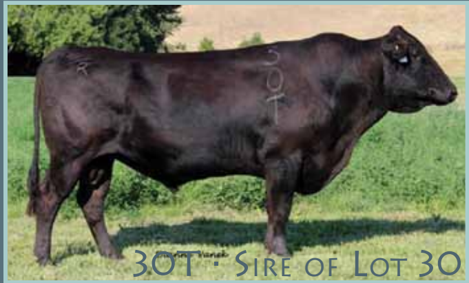
30T - SIRE OF LOT 30

DAM BAR R JIRO 22T JVP FUKUTSURU-068 BAR R 68W BAR R MISS 2N MISS BAR R 14D RTR ONYX 77A SIMMENTAL-ANGUS