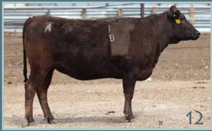
National Wagyu Sire Summary 2014

DAM BR TAKASANJI 8650 BAR R TAKAZAKURA 0606 3612 BR MS TAKASANJI 8650/1001 MISS BAR R 2400H BR MS ITOFUKU 7652 BR ITOMICHI/0602 4632 MR MS FUKU-9662 2656