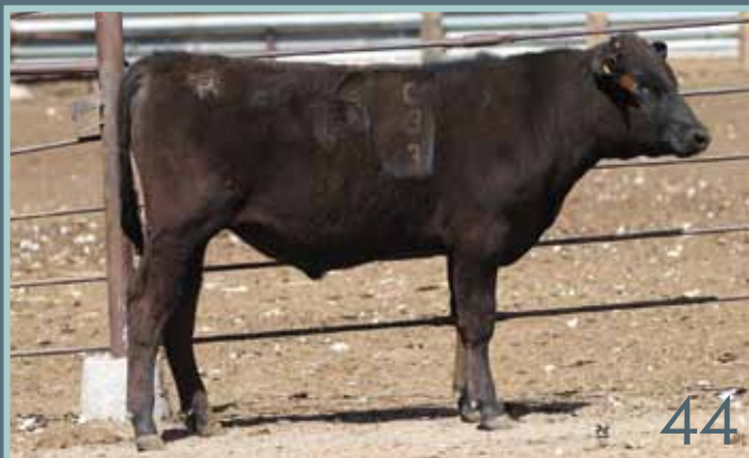
National Wagyu Sire Summary 2014