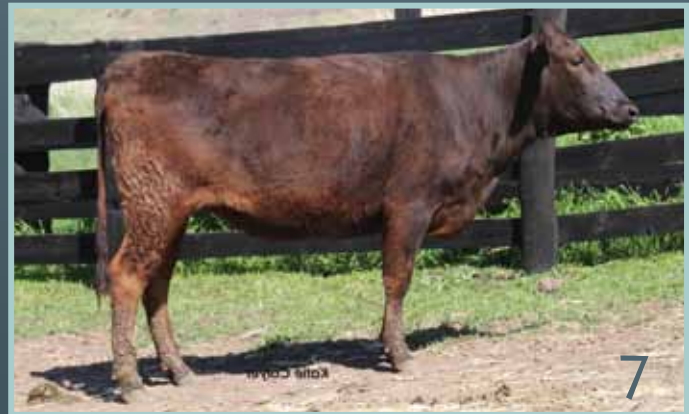
National Wagyu Sire Summary 2014

DAM BAR R TAKASURU 1 K WORLD K'S TAKAZAKURA JVP MS FUKUSHIGE T10E BAR R 37P MISS BAR R 301H WORLD K'S MICHIFUKU JVP MS KIKUCHISA 19E