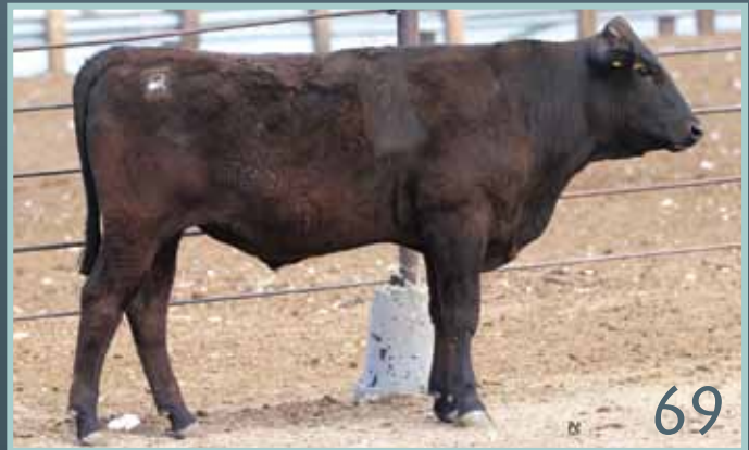
National Wagyu Sire Summary 2014

DAM LMR ITOZURUDOI 8161U ITOZURU DOI BAR R 51X CF 500 SUZIWONG ITOMORITAKA J2703 BR MS KIKUHANA 7981