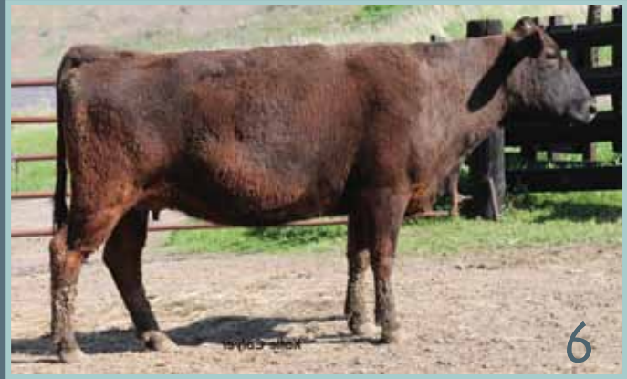
National Wagyu Sire Summary 2014

DAM WORLD K'S YASUFUKU JR YASUFUKU 930 BAR R YASAFUKU 38R KANEKO 5 MISS BAR R 321H WORLD K'S MICHIFUKU JVP MS KIKUCHISA 19E