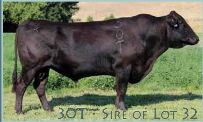
National Wagyu Sire Summary 2014

DAM BAR RX BAR R 15U BAR R 12Z BAR R 23R BR MS TAKAMICHI 6406 BR MICH/8614 3310 BR MS TAK-0606 4103