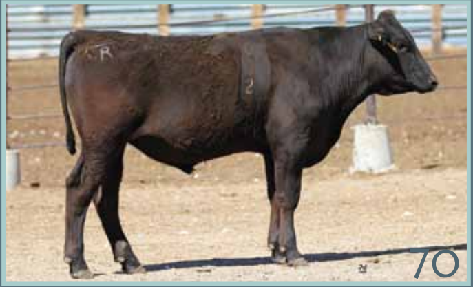
National Wagyu Sire Summary 2016

DAM BAR R SHIGESHIGETANI 30T WORLD K'S SHIGESHIGETANI BAR R 68P BAR R 60Y BAR R 50R BAR R TAKASURU 1 K MISS BAR R 22G