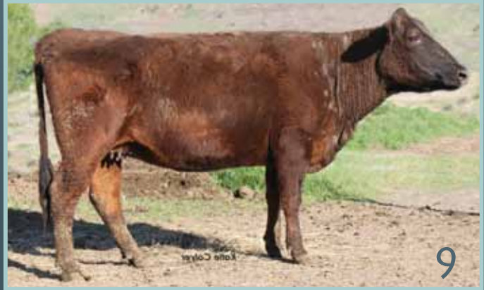
National Wagyu Sire Summary 2014

SIRE WORLD K'S SANJIROU BAR R SANJIROU 4P BAR R MISS FUKUTSURU 47K WORLD K'S MICHIFUKU WORLD K'S SUZUTANI JVP FUKUTSURU-068 MISS BAR R 301H DAM BAR R MICHISURU 2 K BAR R 66P MISS BAR R 322H WORLD K'S MICHIFUKU JVP MS FUKUSHIGE T10E JVP KIKUSHIGE 406E JVP MS FUKUKANE 05E