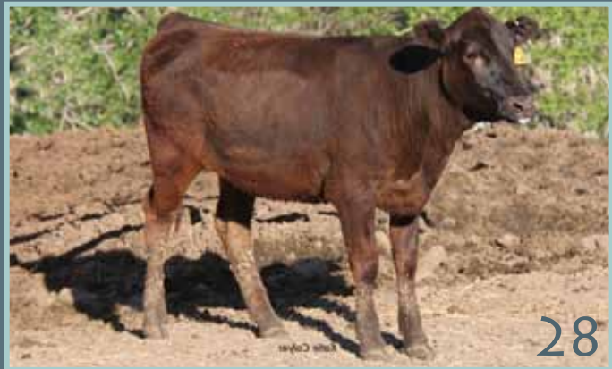
National Wagyu Sire Summary 2014