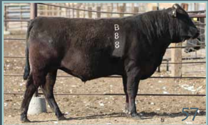
National Wagyu Sire Summary 2014

DAM BAR R 15U BAR R ICHIRO 32R BAR R 23X BAR-R-13E BAR-R-13E JVP YASUTANISAKURA ANGUS COW