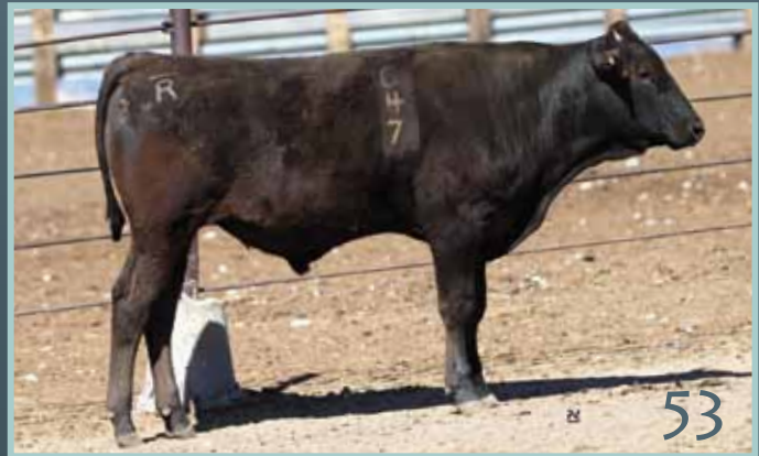
National Wagyu Sire Summary 2014

DAM LMR ITOZURUDOI 8100U ITOZURU DOI BAR R 17X CF 503 BAR R 44P BAR R MICHISURU 2 K JVP MS KIKUSHIGE 09E