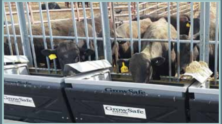
National Wagyu Sire Summary 2014