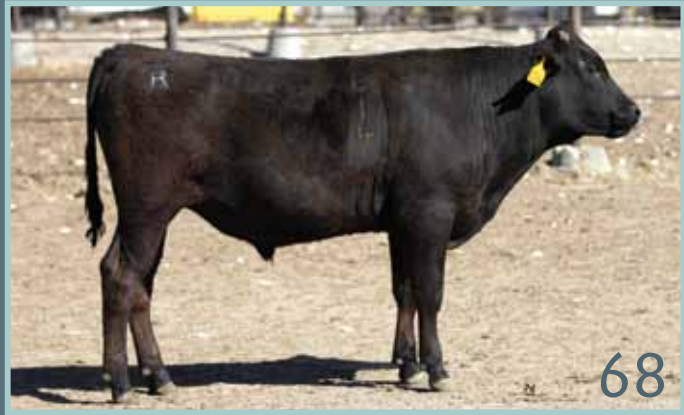
National Wagyu Sire Summary 2014

DAM BAR R 65W BAR R JIRO 22T BAR R 32Z BAR R 20T BAR R 5U BAR R 10S BAR R 13P