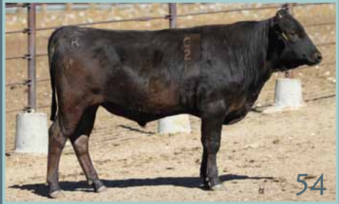
National Wagyu Sire Summary 2014

DAM WORLD K'S SHIGESHIGETANI WORLD K'S HARUKI 2 BAR R SHIGESHIGETANI 14T WORLD K'S SUZUTANI BAR R MISS 51N BAR R MICHISURU 2 K BAR R MISS 51J