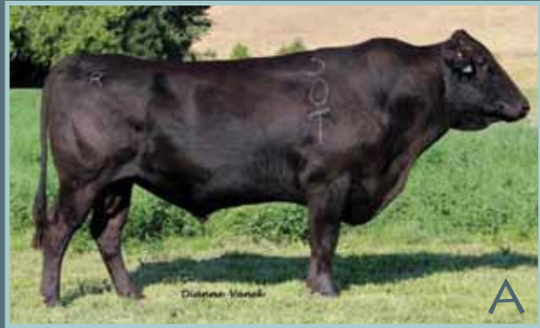
National Wagyu Sire Summary 2014

DAM BAR R MICHISURU 2K WORLD K'S MICHIFUKU BAR R 68P JVP MS KUKUSHIGE T10E MISS BAR R 18H BLUE ROCK HARUKI JVP MS KIKUSHIGE 24E