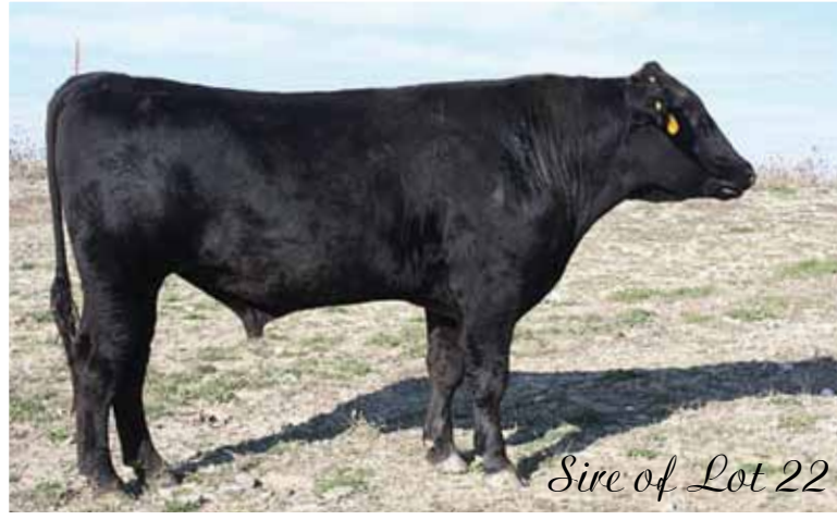
Sire of Lot 22