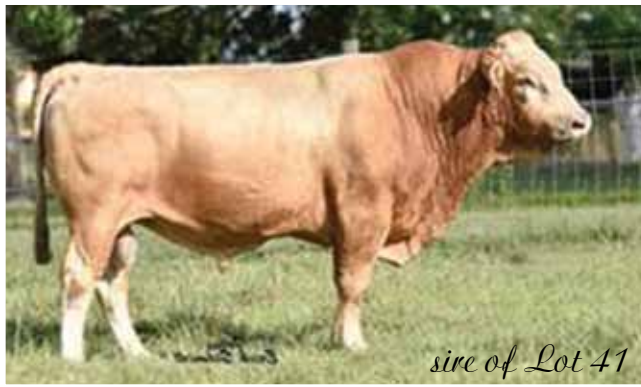
sire of Lot 41