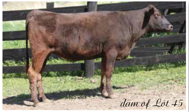
dam of Lot 45