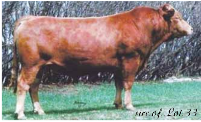
sire of Lot 33