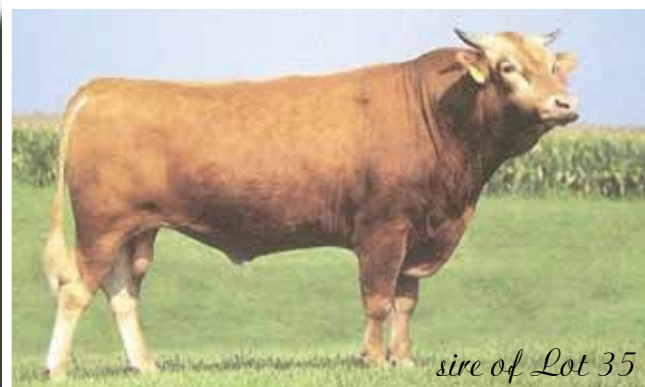
sire of Lot 35