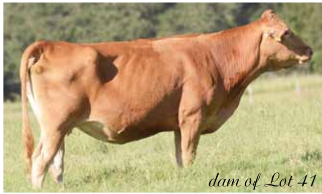
dam of Lot 41