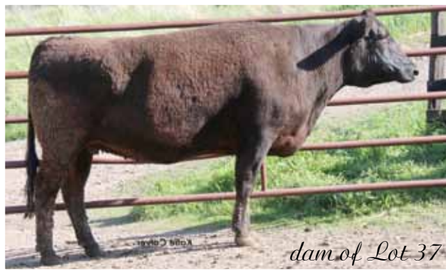
dam of Lot 37