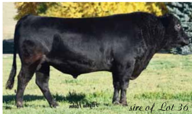
sire of Lot 36

• This is a classic Tamamaru over a Shigemaru sired cow that is designed to blend carcass production and carcass quality together. 3036's mother is the original import Akiko a cow very well known for improving carcasses. She is a blend of the Mitsutake and Dai 2 Shigenami lines which makes her one of the most diverse cows of all of the original imports. 3036 is a very fertile cow and has a stellar history as a production cow at the ranch. This is your opportunity to pick up 1 st generation Shigemaru, Akiko and Tamamaru genetics wound together in a very nice package.