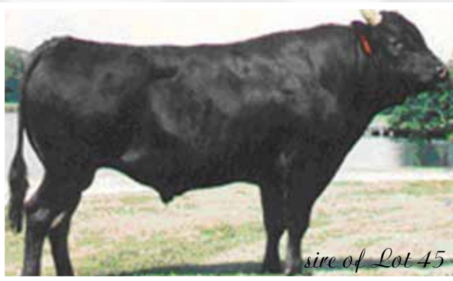
sire of Lot 45