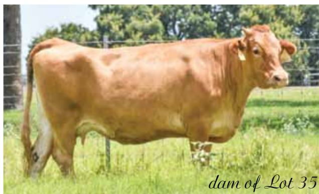
dam of Lot 35