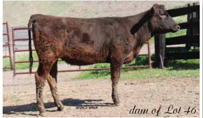
dam of Lot 46