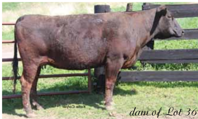
dam of Lot 36