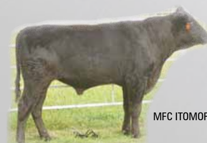
MFC ITOMORITAKA 443B