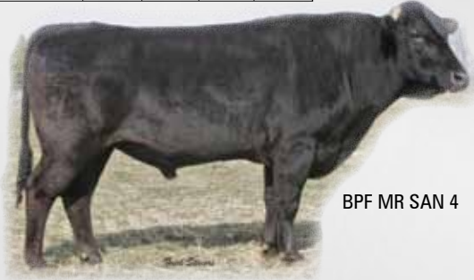
BPF MR SAN 4