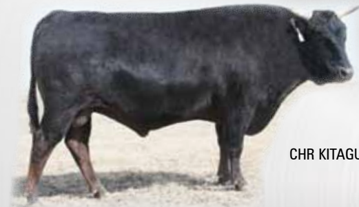
CHR KITAGUNI 07K