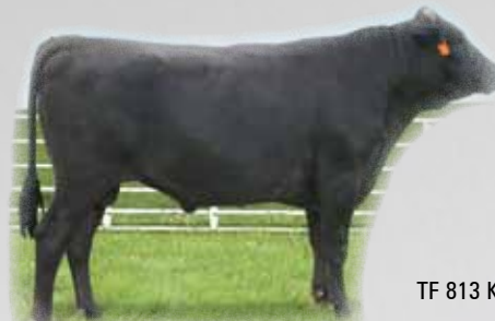
TF 813 KIMITOFUKU