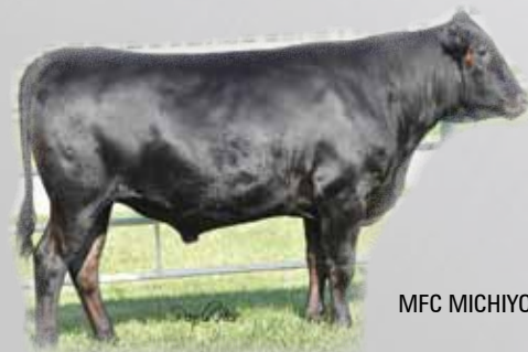
MFC MICHİYOSHI 522C