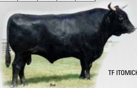
TF ITOMICHI 1/2