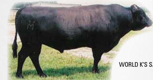
WORLD K'S SANJIROU