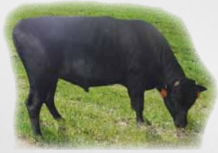
TF YASUTANI 1012