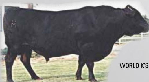
WORLD K'S BEJIROU