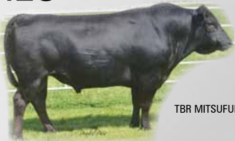
TBR MITSUFUKU 9028W