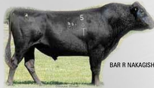
BAR R NAKAGISHIRO 56T