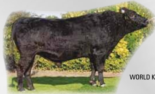
WORLD K'S HARUKI 2