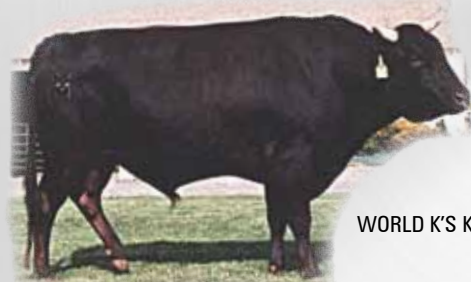
WORLD K'S KITAGUNI JR.