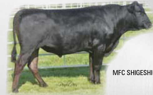
MFC SHIGESHIGETANI 2-12