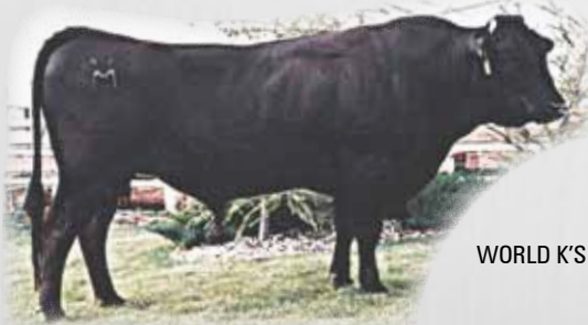
WORLD K'S KAGE