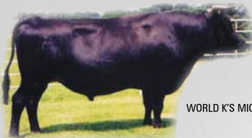
WORLD K'S MICHIFUKU