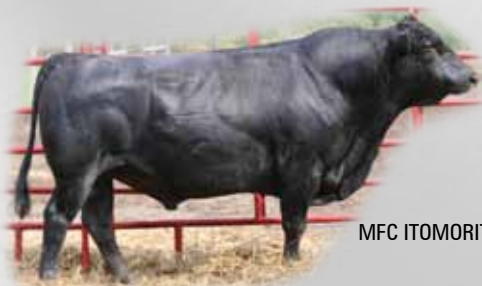
MFC ITOMORITAKA 0-41