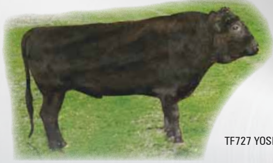
TF727 YOSHIZURU 1

SHIGESHIGENAMI 10632 FUKUYUKI ITOMICHI HIKOKURA 1/7