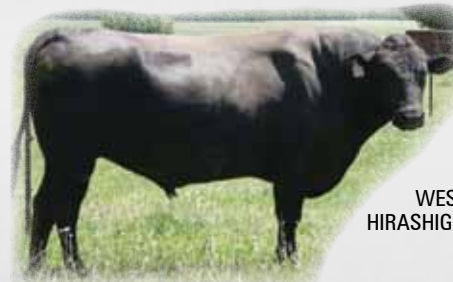
WESTHOLME HIRASHIGETAYASU Z278