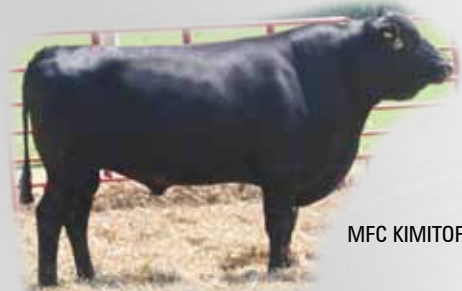
MFC KIMITOFUKU 434B