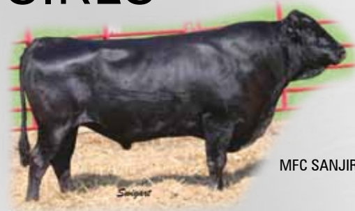
MFC SANJIROU 3-39

MONJIRO 11550 MICHIKO 655635 TANISHIGE 1526 SUZUNAMI 472255 WORLD K'S MICHIFUKU WORLD K'S SUZUTANI KENRYU 1905 NAGAYOSHI 472016