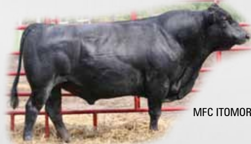
MFC ITOMORITAKA 0-4I