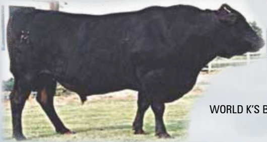
WORLD K'S BEJIROU