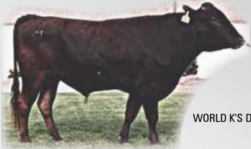
WORLD K'S DONARUDO