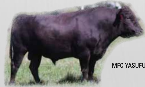
MFC YASUFUKU JR 7-12