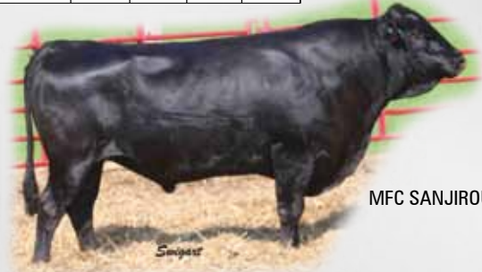
MFC SANJIROU 3-39