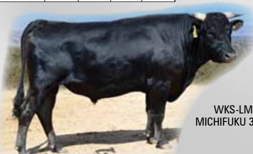
WKS-LMR MICHIFUKU 3500A