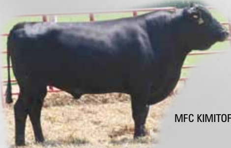
MFC KIMITOFUKU 434B